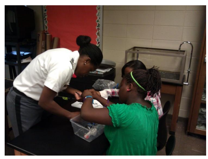
Department of English and Philosophy

The workshop was a complete success. Not only was the workshop a positive experience for the students, it also served as a venue to promote West Point and its desire to engage students in hands-on STEM activities at a young age.