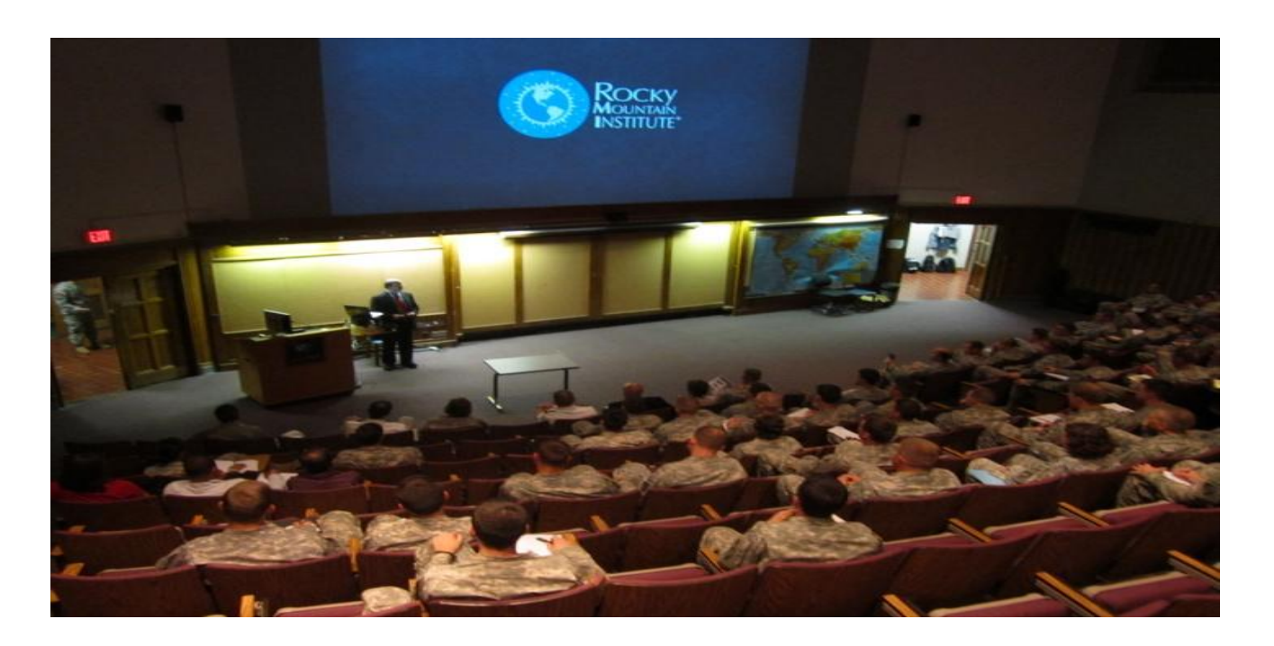
Photo: Cadets and faculty listen to Dr. Lovins present his extraordinary ideas regarding reinventing fire.

3. Ecological Research. On 17 September 2012, 19 Environmental Science Firsties in Ecology (EV471) collected data on coniferous tree needles on West Point. Although needles on the same tree might be expected to conform to a genetically determined size, differences in needle age, exposure to sun or shade, wind, temperature, or moisture supplied through a particular branch could influence needle length. During the lab cadet teams developed a hypothesis, determined a research design, collected data, evaluated data with statistics, and made conclusions to determine if needle length differs on a tree based upon the needles' proximity to sunlight. The Environmental Science majors are being taught field research techniques and the importance of applying the tools of science and statistics to solve ecological questions. POC is LTC Mark Smith, mark.smith@usma.edu.