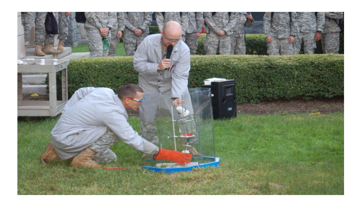
Department of Civil and Mechanical Engineering