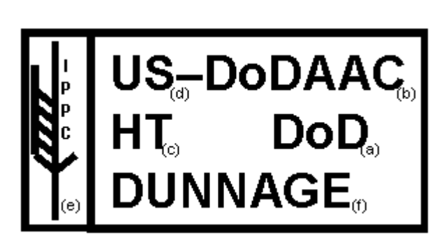
Figure C2.F1. ISPM 15 Certification Mark

C2.5.1. <u>ISPM 15 Certification Marking</u>. DoD Components that are self-certified or ALSC accredited are authorized to use ISPM 15 certification mark on all WPM that fully complies with ISPM 15 guidelines. The ISPM 15 certification marking (see Figure C2.F1.) shall display the letters "US" in bold (d), the packaging activity's Department of Defense Activity Address Code (DODAAC) (b), and either "HT" denoting heat treated WPM or "MB" denoting WPM "fumigated" with Methyl Bromide as noted in the Figure C2.F1. by "HT" (c). The marking "TRADEMARK" (a) represents the logo of the U.S. services that can be displayed under the DODAAC. The marking "DUNNAGE" (f) is used strictly for dunnage, otherwise it is left blank. Item (e) is the approved International symbol for compliant wood packaging material.