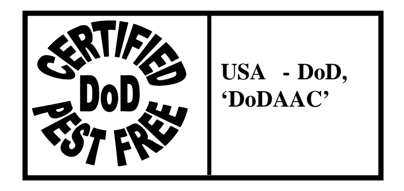
Figure AP3.F1. DoD "Pest Free" Certification Mark

<u>DoD</u> "Pest Free" Certification Marking. Certification and application of the DoD "Pest Free" certification marking (see Figure AP3.F1) is authorized if the material successfully passes the established moisture and visual inspection standards (see paragraph AP3.2.) and has a valid date of pack prior to December 31, 2007. The DoD "Pest Free" certification mark shall display the letters "DoD," the words "Certified Pest Free," and the DODAAC of the packaging or shipping activity. The DODAAC provides identification. (See Figure AP3.F1.)