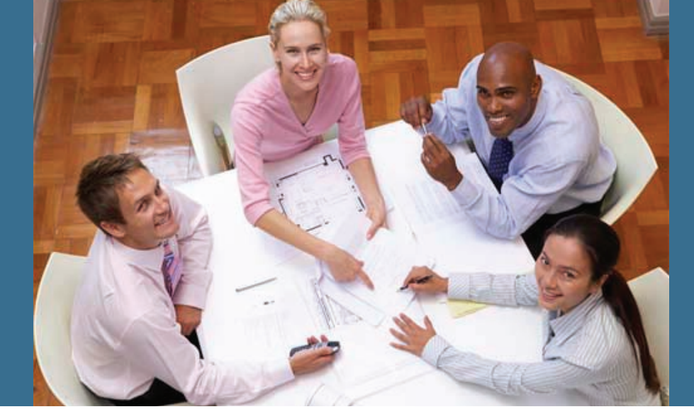
(Continued from previous page.)

Note: Regular maintenance of your Dun and Bradstreet (D&B) and CCR information is extremely important. Be sure to check it every 30 days, especially if you have recently moved or plan to move. Additionally, be sure that your company's information in GSAAdvantage!<sup>®</sup> and eLibrary is up to date and consistent with that in CCR and D&B.