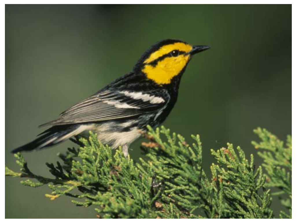
A grant in Texas will enable the acquisition of the 289-acre Barker Tract in Hays County to protect an area of documented golden-cheeked warbler habitat and provide suitable nesting areas for the black-capped vireo, both of which are spotlight species for the region.