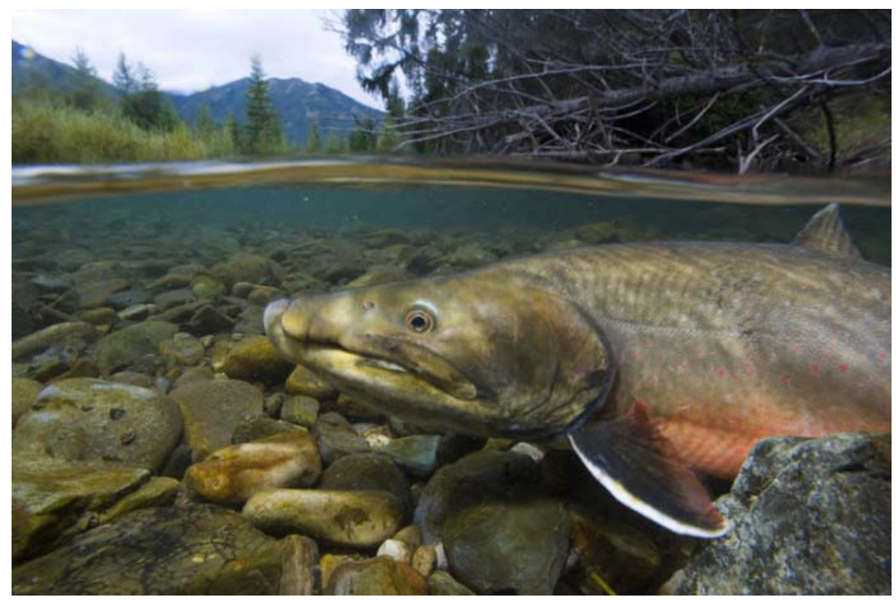
A grant in Washington will ensure the permanent protection of over 4,000 acres in southern Asotin County, including four miles of critical bull trout habitat along the Lower Grande Ronde River and three miles or riparian habitat along Cougar Creek.

(Section 6 of the Endangered Species Act)