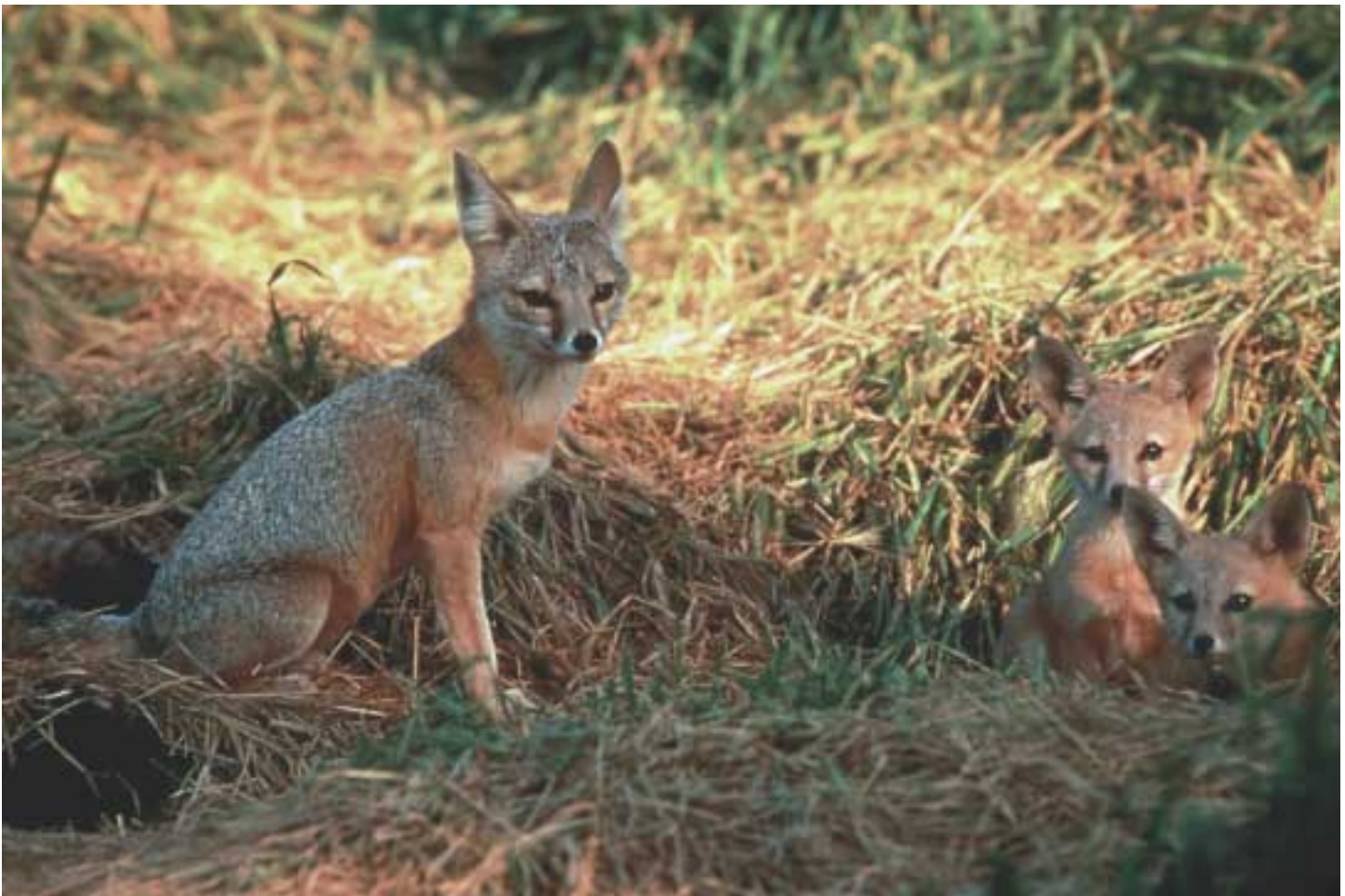
San Joaquin kit foxes (Vulpes macrotis mutica)