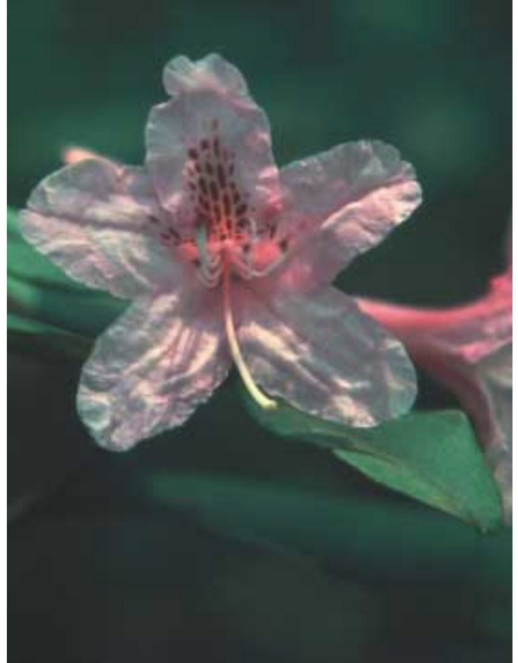
Chapman rhododendron ( Rhododendron chapmanii), an endangered plant from Florida