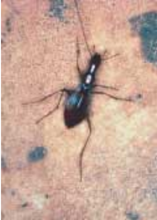
Tooth Cave ground beetle (Rhadine persephone), an endangered insect from Texas