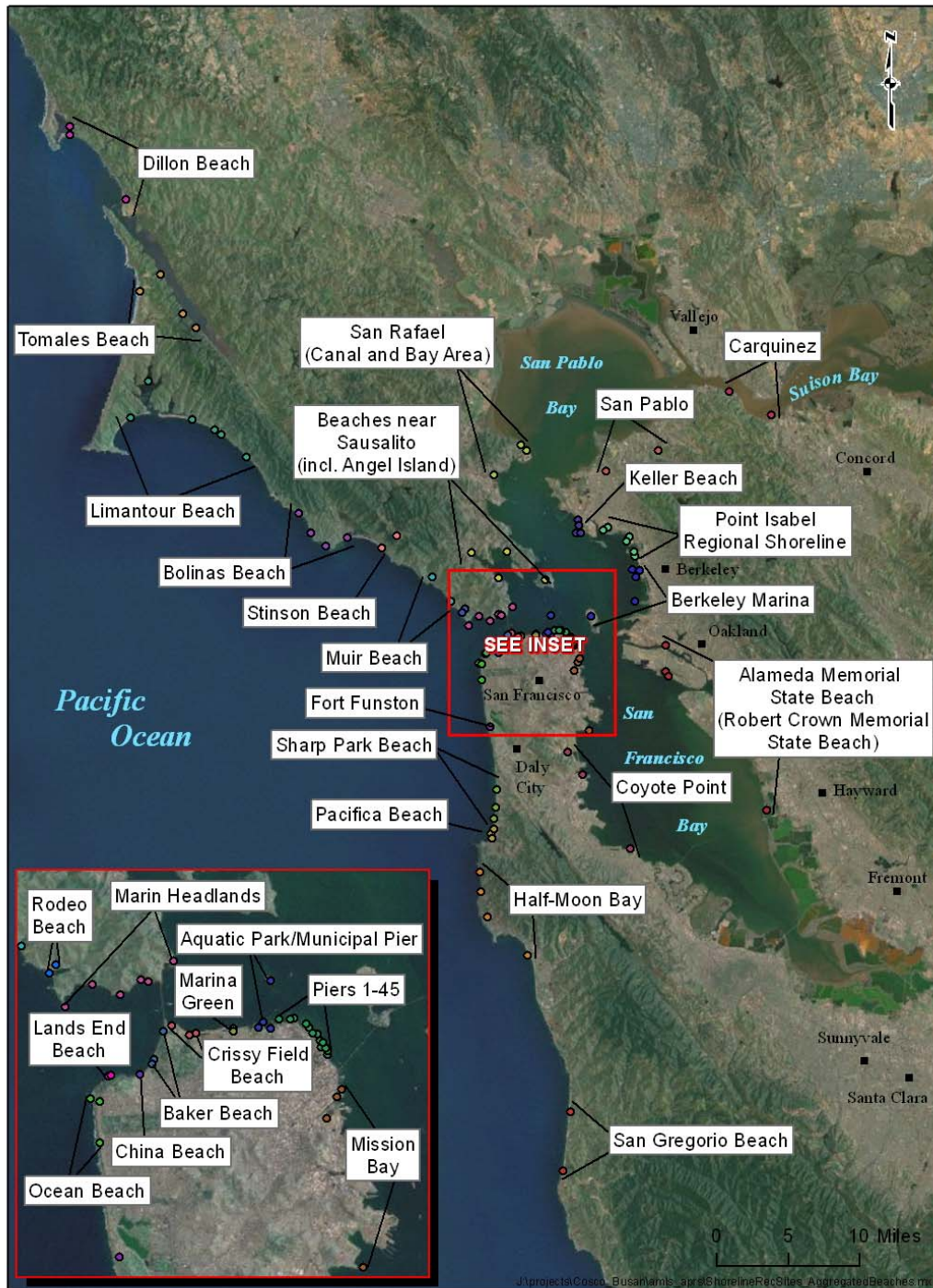
Figure J.2. Aggregate recreation sites.