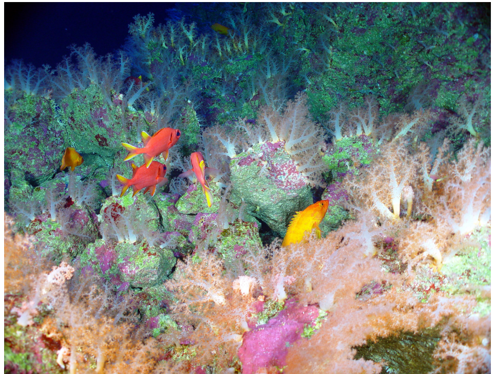
Soft corals and tropical fish at the summit of East Diamante volcano, nicknamed by scientists as the "Aquarium."

The Secretary of Commerce, through the National Oceanic and Atmospheric Administration, has primary management responsibility for fishery-related activities in the waters of the Islands Unit.