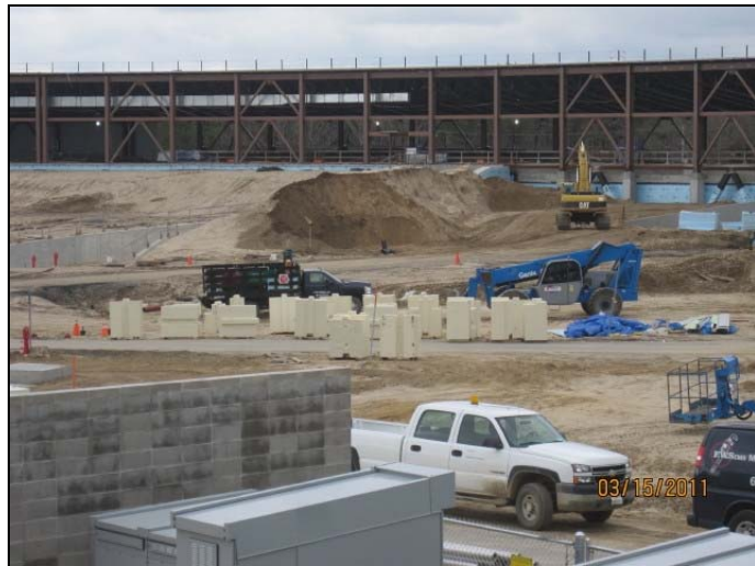
Figure 6. RF cavity Test Area shield blocks staged for installation.

Access for contractors to work in the area is being controlled under a work permit system. Building systems in pentant 1 have been commissioned and are now in operation, but some additional balancing and final adjustment will be required later when the entire building is done and full loads are available. Systems required to support experimental operations, such as liquid nitrogen and process cooling water, will be commissioned closer to the time they are needed, to reduce maintenance and operating costs and conserve system warranties.