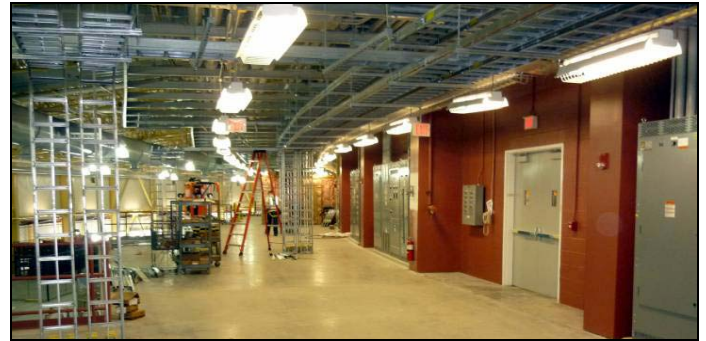
Figure 5. The pentant 1 electrical mezzanine, ready for the installation of accelerator systems equipment.

Overall progress in constructing the conventional facilities continues slightly ahead of schedule. March brought a significant CF milestone as the project took beneficial occupancy of the first section of the ring building, pentant 1. Though temperatures were below average there was no snow, and overall construction activity ramped up again for both the ring building and LOB contracts. The smaller contracts for utility systems are now all functional; only punchlist work remains at the chilled water plant expansion project.