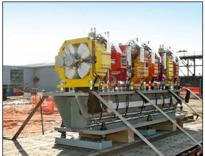
Figure 1. First fully equipped magnet girder, in front of the NSLS-II ring building.

Magnets. A fully equipped magnet girder with magnets and vacuum and diagnostic components has been assembled and transported to the NSLS-II ring building for checks (Fig. 1).