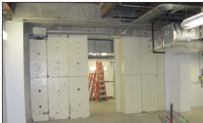
Figure 7. Removable shield wall being installed in the tunnel from service building 1 to the storage ring tunnel.

The next areas slated for beneficial occupancy are the RF building and RF compressor building, which are on track for availability in early May. Enclosure of those buildings is nearly complete, interior finish work is progressing well, the electrical service in the buildings is energized, and HVAC systems are being readied for commissioning.