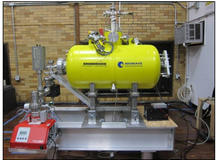
Figure 3. Passive third-harmonic superconducting cavity for bunch lengthening, ready at the vendor for delivery to BNL.

RF. The passive superconducting cavity needed for bunch length control was completed by the manufacturer. The cryostat is ready for delivery to BNL (Fig. 3), where the external higher order mode dampers will be installed before the cavity is ready for installation in the storage ring tunnel.