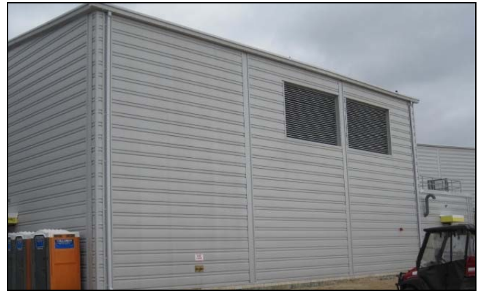
Figure 8. Exterior siding is completed on service building 1.

paneling is in place through most of pentant 2. The injection building enclosure is lagging somewhat, but the contractor is mobilizing extra crews to make up time lost to weather.