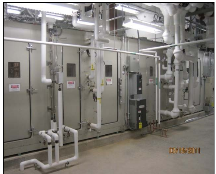
Figure 9. Air handling unit for pentant 1, in service building 1.

Interior mechanical, electrical, and plumbing are in progress in each of the remaining pentants and service buildings. The work includes HVAC ductwork, equipment placement and installation, fire protection, heating/cooling system piping, compressed air, nitrogen, and other utility services. Although several early beneficial occupancy dates were impacted by the winter weather, we anticipate completing the later milestones several months early, and before they could be impacted by next winter. All significant concrete work is now done, with placement of the last section of Experimental floor.