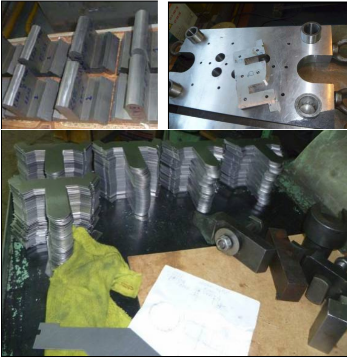
Figure 2. Production of the NSLS-II booster has started at BINP.

booster team at BINP has started to manufacture production tooling and first-article accelerator components (Fig. 2).