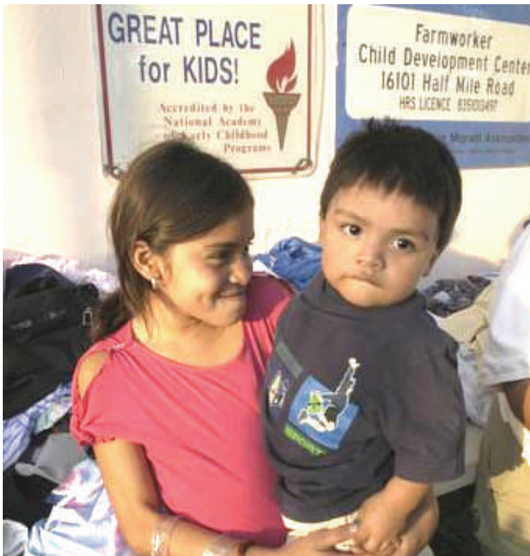
Children outside of the farm worker development site.

As part of the National Good Agricultural Practices (GAPS) Program at Cornell University, an education program for farm workers has been developed. Its emphasis is on the production and distribution of multi-faceted educational materials that promote good health and proper hygiene for everyone involved in the production and packing of fresh produce. Using principles of adult learning, the educational materials have been designed to create a comprehensive worker training program that introduces information and then provides behavioral reinforcement of key topics. For instance, Fruits, Vegetables, and Food Safety: Health and Hygiene on the Farm is a 15 minute worker training video that offers guidance to workers on proper hand washing and toilet use, with emphasis on how worker health can affect the safety of fresh fruits and vegetables. Hygiene topics discussed in this video are reinforced with a series of laminated field hygiene posters.