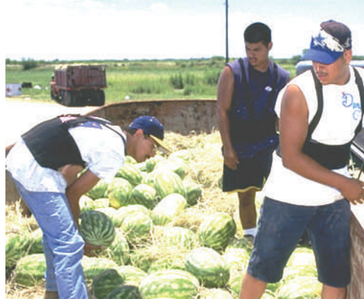
Farm workers are an extremely important part of the fresh produce industry.

Farm worker hygiene is a crucial component of the fresh produce industry because workers harvest and pack many fruits and vegetables by hand. Their health and hygiene can directly impact the safety of the fresh produce they touch. In 2002, a survey of growers and packers in New York revealed that nearly 57 percent never mentioned the importance of hand washing to their farm workers. In turn, a survey of farm workers revealed that almost 45 percent believed that it was proper to put used toilet paper in adjacent trash cans rather than in the toilet. These surveys highlight the need for culturally relevant educational materials that teach the importance of proper worker hygiene during production and packing of fresh fruits and vegetables.