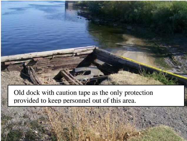
Old dock with caution tape as the only protection provided to keep personnel out of this area.