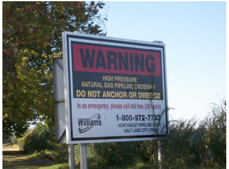
Sign located on the shore of the Columbia River.