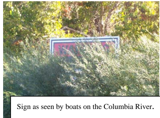
Sign as seen by boats on the Columbia River.