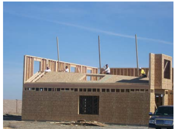
No fall protection or PPE used when raising the wall for the second floor of a residential structure