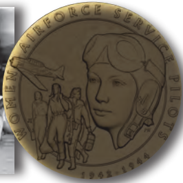
Women's Airforce Service Pilots Medal