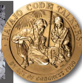
Navajo Code Talkers Medal