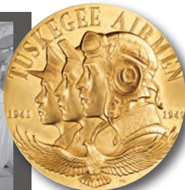
Tuskegee Airmen Medal