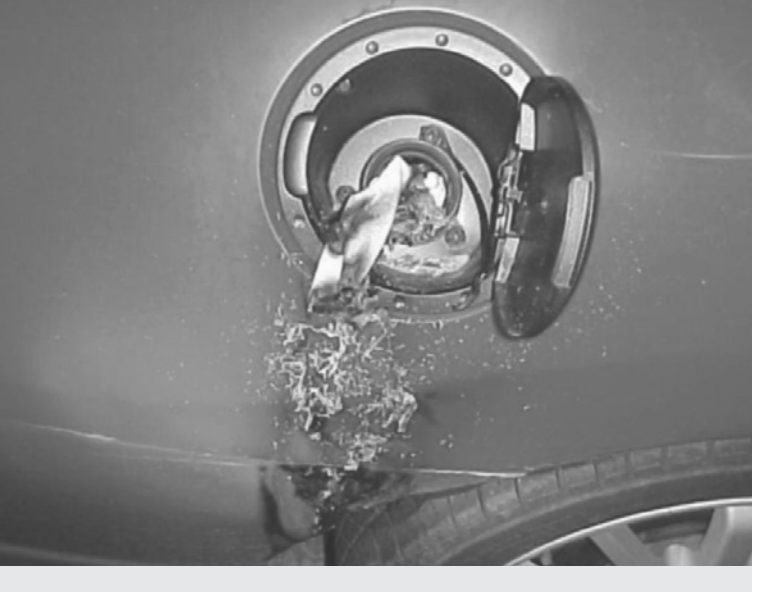
Deliberate fire set at the opening of a gas tank.

The percentage of motor vehicle fires that are arsons has also dropped 80 percent in the past decade from 16.5 percent in 1993 to 4.8 percent in 2005.