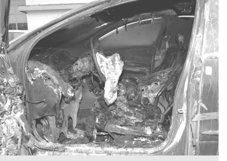
Car interior after an arson fire.