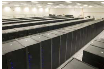
The Roadrunner Project: www.lanl.gov/orgs/hpc/roadrunner