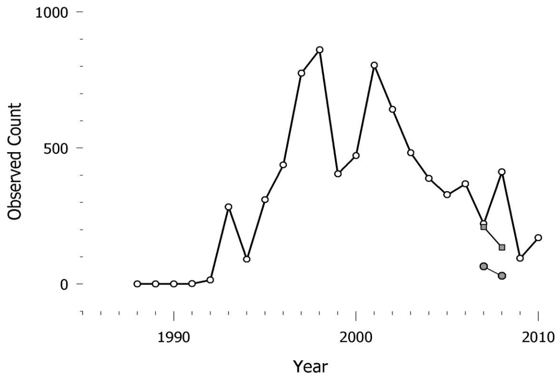
Figure 2. Anadromous adult steelhead observed in the Santa Carmel System. Open symbols: recent steelhead counts at the San Clemente Dam fish ladder at river mile 18.6 of the Carmel River. Gray symbols: high and low estimates of the number of steelhead spawning downstream of the San Clemente Dam (Williams et al. 2011).