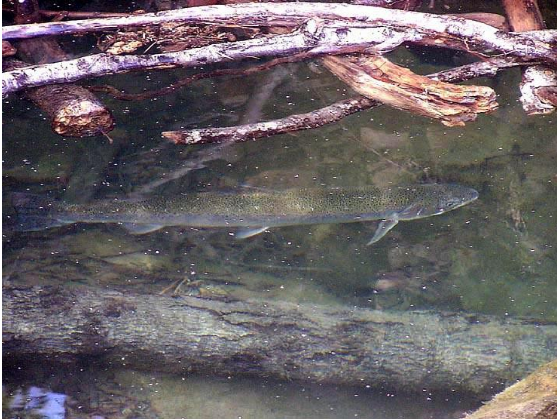
San Carpoforo Creek Steelhead

National Marine Fisheries Service Southwest Region Long Beach, CA