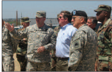
REP. CALVERT tours the southern border and discusses issues with Border Patrol on how to gain operational control of our southern border to prevent illegal crossings, drug trafficking and violence.

H.R. 997 – English Only. Declares English the official language of the United States.