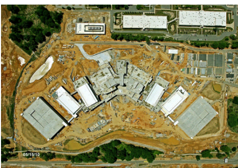
SAMMC-N Consolidated Tower, 20 May 10