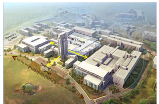
Proposed Future Vision of Central Comprehensive Clinical Expansion

With few exceptions, the Defense Health Board (DHB) panel found the plans for FBCH to meet the new statutory, world-class medical facility standard. The Department has also made substantial progress in addressing the panel's recommendations for WRNMMC.