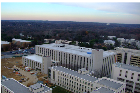
Consolidated Tower, 28 Apr 10