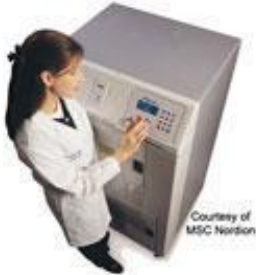
Figure 2: Small Irradiator

The U.S. Nuclear Regulatory Commission (NRC) and NRC “Agreement States” 1 regulate the safe and secure use of these irradiators and other radioactive materials. NRC’s Office of Federal and State Materials and Environmental Management Programs (FSME) develops and implements rules and guidance for the safe and secure use of source, byproduct, and special nuclear material in industrial, medical, academic, and commercial activities, including irradiators. Inspections to ensure compliance with these regulations are conducted by approximately 46 NRC materials inspectors and numerous inspectors within the 37 Agreement States. Nationwide, there are approximately 50 licensees that operate about 50 large irradiators that contain more than 10,000 curies of Cobalt-60. (See Figure 1 for an illustration of a large irradiator.) Additionally, there are approximately 590 licensees that operate about 1,100 smaller type irradiators that use lesser quantities of radioactive materials. (See Figure 2 for a picture of a smaller type irradiator.)