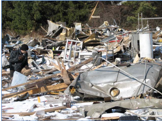
Figure 12: Four were killed when propane vapors ignited and exploded at the Little General store in Ghent, WV. The CSB issued its investigative report September 25, 2008.

The CSB has also issued recommendations to state and local governments, individual companies, and specific facilities. The CSB recommendations issued pursuant to an investigation of a major chlorine release in Glendale, AZ, in 2003 prompted the Maricopa County Air Control Agency to modify the facility's air pollution permit to include safety controls. This change represents a novel mechanism to integrate safety and air pollution goals, which are often at odds or uncoordinated in legislation and enforcement. In addition, following the Little General Store investigation, the CSB issued a recommendation to the NFPA for enhanced mandatory training for propane technicians.