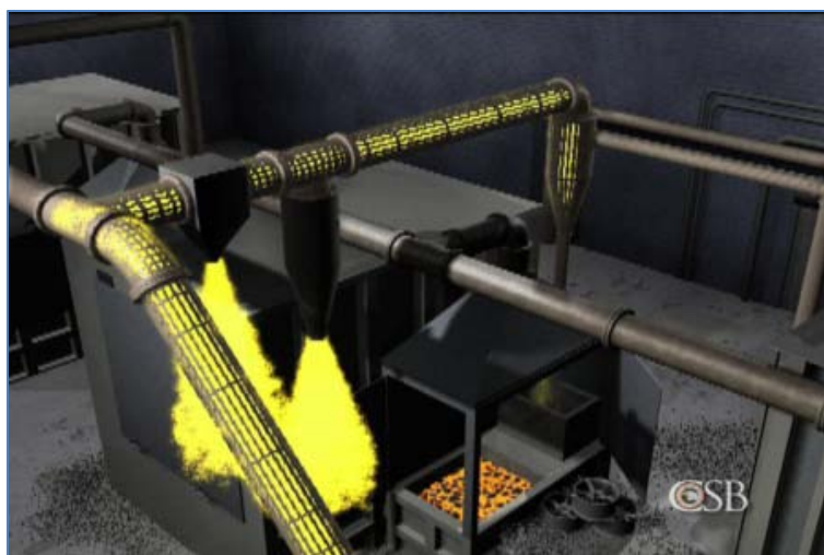
Figure 11: Ignited aluminum dust venting from pipes at the Hayes Lemmerz plant in Huntington, IN, and the subject of the combustible dust study. (Dramatization from Combustible Dust: An Insidious Hazard , July 28, 2009)

The Clean Air Act Amendments of 1990 authorizes the CSB to conduct research and studies with respect to the potential for incident releases. To the extent practical, this should be in cooperation with other federal agencies, state and local agencies, and associations or organizations from the industrial and commercial sectors. Safety studies, for example, may examine trends from incident data or information regarding emerging issues, and analyze such data to determine what safety measures may be recommended.