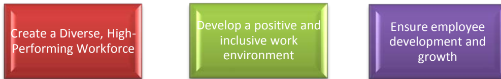
Figure 15. CSB Human Capital Triad

development, and succession planning of its employees to grow their efficiency and effectiveness. The CSB's human capital approach is based on a triad of strategies that foster diversity, inclusiveness, and employee development. These workforce strategies create a diverse, high-performance workforce, develop a positive and inclusive work environment, and create an atmosphere to ensure employee development and growth.