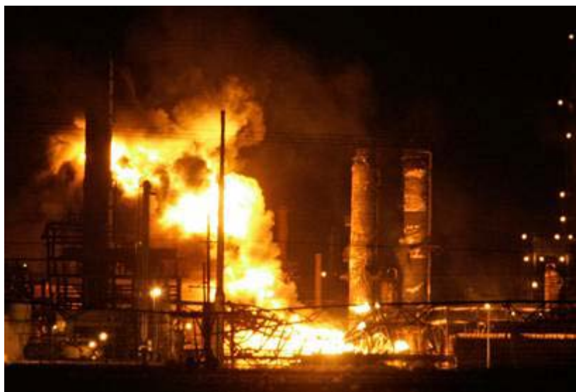
Figure 1: Liquefied petroleum gas fire at Valero's Mckee Refinery near Sunray, TX, February 16, 2007

Goal 3: Preserve the public trust by maintaining and improving organizational excellence.