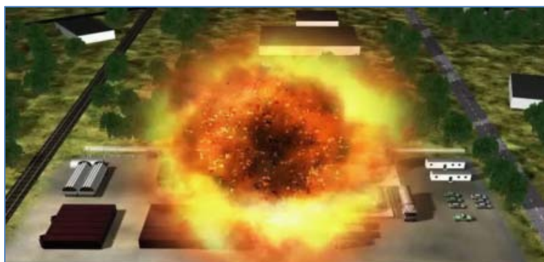
Figure 8: On December 19, 2007, four were killed and 13 transported to the hospital after an explosion at T2 Laboratories, Inc. during the production of a gasoline additive. This high-quality, comprehensive report was issued on September 15, 2009. (Dramatization from CSB safety video, Runaway: Explosion at T2 Laboratories , September 22, 2009)