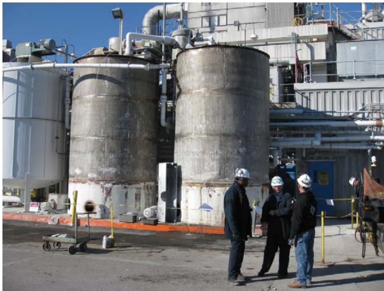
Figure 16. CSB investigators at DuPont plant after a fatal hotwork explosion in November 2010

Essentially, the CSB uses the Office of Personnel Management (OPM) workforce planning model to analyze its workforce; it integrates the strategic goals with its human capital objectives by identifying the human capital required to meet organizational goals and competency gaps, while developing strategies to address human capital needs and close identified gaps.