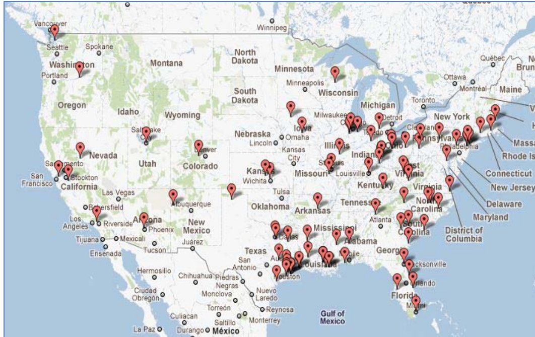
Figure 2: CSB completed investigations since 1998

Because the agency can respond to any domestic incident, deployments have occurred in most states. The types of incidents investigated include issues such as oil field, static electricity, explosions, flammable gas, dust explosions, and confined spaces. In addition, international stakeholders have benefited from lessons learned from US domestic incidents: our recommendations on industry best practices have been adopted in numerous countries over the past decade and have resulted in improved worldwide process safety knowledge. In fact, the CSB's investigative reports and safety videos are used extensively around the world, especially in countries with a significant chemical and oil industry presence. The CSB receives requests for safety briefings regularly from stakeholders in South America, Africa, Europe, and Asia; our videos have been subtitled in Spanish, French, Korean, and Chinese and used in employee training programs.