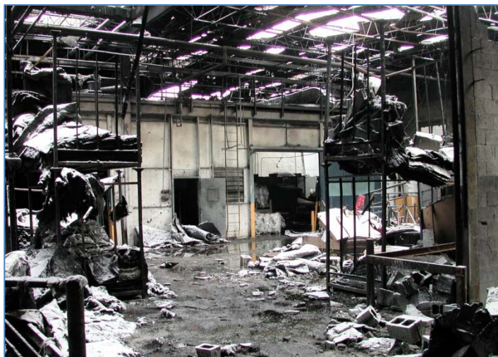
Figure 10: Damage from the February 20, 2003, dust explosion at the CTA Acoustics manufacturing plant in Corbin, KY.

modified guidance to their customers to strongly advise against gas blows. These actions, as a result of the CSB recommendations, substantially enhanced protection to workers and the public in and near gas-fired power plants.