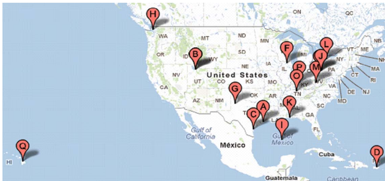
Figure 4: Map of deployments for ongoing CSB investigations

As a principal federal agency investigating chemical incidents and hazards, the CSB deploys investigation teams to major incidents shortly after they occur. These incidents can occur at any location across the United States, as shown in Figure 4 of ongoing investigations as of October 2011.