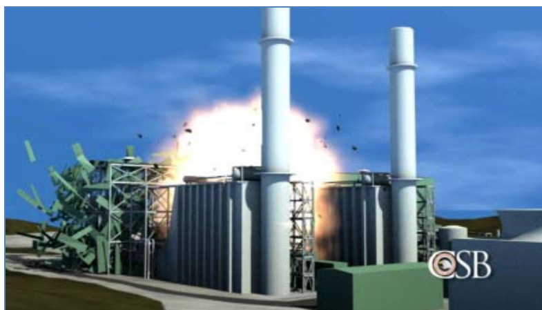
Figure 6: Explosion at Kleen Energy plant in Middletown, CT. Six workers were fatally injured after a natural gas explosion. . (Dramatization from CSB safety video, Deadly Practices , February 3, 2011)

To ensure that lessons from incidents are properly disseminated, incident investigations must be completed in a timely manner. After an incident, the community and stakeholders expect timely and accurate findings. These important findings and recommendations are offered to help reduce the occurrence of similar incidents. The CSB endeavors to complete its thorough investigations as