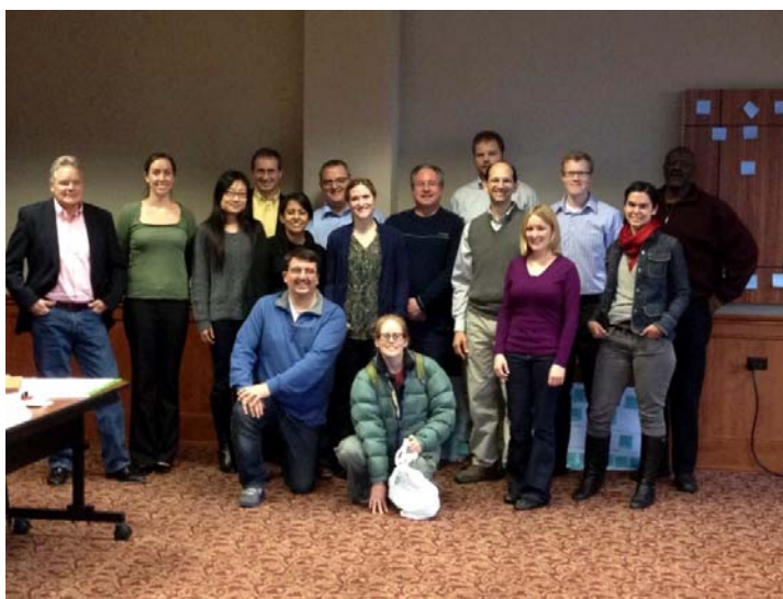
Figure 17 CSB investigation and recommendations staff at a training session

The CSB operates in a highly communicative and cooperative work environment, which is especially necessary as its small size necessitates that informal communication channels facilitate the accomplishment of its mission objectives. This philosophy of open communication is transmitted by top leadership on an ongoing basis. For example, the entire agency staff is invited to participate in weekly agency leadership meetings. By opening these meetings to all staff, top leadership