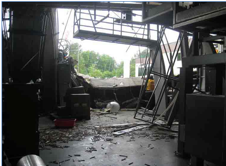
Figure 5: 12 Investigative staff deployed to the ConAgra plant after an explosion on June 9, 2009 that killed 4 workers and injured dozens of others.

As discussed, the purpose of the CSB's investigations is to determine the facts, conditions, and underlying and contributing causes of chemical incidents and develop recommendations to help