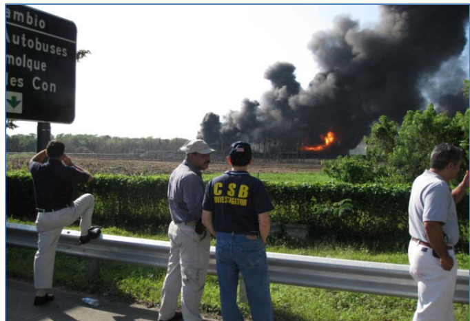
Figure 18: CSB investigators must understand the culture and attitudes of local employees, such as those at the Caribbean Petroleum facility in Puerto

Within the next 25 years, the US population is estimated to grow to 364 million, up from 308 million in 2010. In addition, the population is aging: those between 65 and 84 will grow 114 percent from 2000 to 2050, a situation that will pose safety challenges, especially if older workers remain in the workplace in industrial settings. In addition, the steady influx of immigrants will add complexity and communication challenges to process safety environments, thus requiring innovation in adapting safety recommendations and approaches. These demographic trends reflect the increasing diversity in our culture; if the CSB is to be