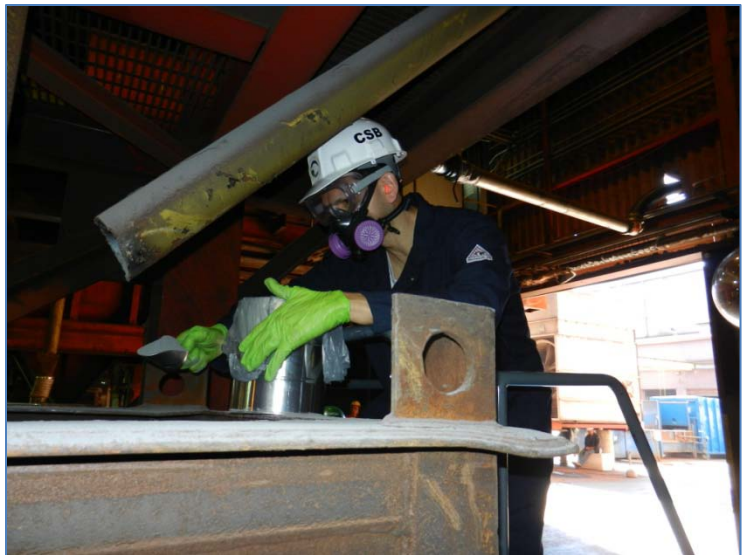
Figure 19: CSB investigator collects dust samples from a Hoeganaes facility in Gallatin, TN, which experienced multiple iron dust flash fires during a six month period in 2011.

In creating this strategic plan, the CSB engaged in significant outreach with stakeholders such as trade associations, other government agencies, worker groups, and universities to obtain feedback. This feedback enabled the CSB to ensure that views from stakeholders regarding the agency’s effectiveness and perceived challenges could be evaluated and considered in developing the content of the plan. In addition, the stakeholder analysis allowed the CSB to ensure that the