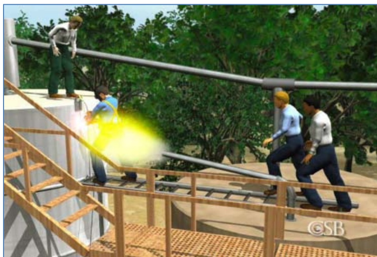
Figure 14: The safety video Dangers of Hot Work won a CINE Golden Eagle award in 2010. (Dramatization from CSB safety video, Dangers of Hot Work , June 7, 2010)

The CSB safety videos have become known as a best practice in disseminating government safety information and have been used to support training by a large number of international organizations. In the four years prior to FY 2012, over 75,000 video DVD compilations were distributed to individuals, trade associations, universities, companies, and unions. The CSB has a specialized outreach plan for each of its produced videos to ensure maximum impact and exposure for various stakeholder communities. The outreach plan will be