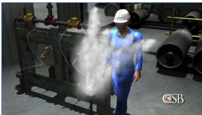
Figure 9: On January 23, 2010, a release of highly toxic phosgene at the DuPont facility in Belle, WV, exposed an operator and resulted in his death. The CSB released its report on September 20, 2011, and issued 14 recommendations to OSHA, DuPont, and industry trade associations. (Dramatization from CSB safety video, Fatal Exposure: Tragedy at DuPont , September 22, 2011)

Following the investigation of the explosion at Kleen Energy in Connecticut in 2010, for example, the CSB made urgent recommendations to several institutions with the goal of