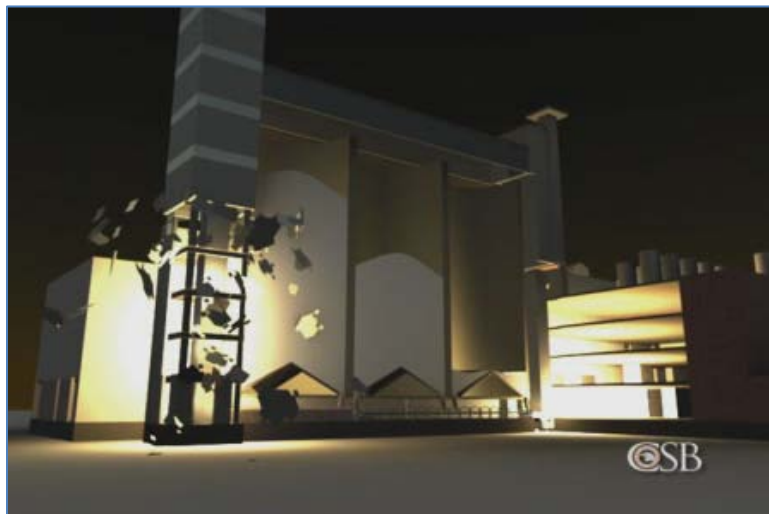
Figure 13: The safety video Inferno: Dust Explosion at Imperial Sugar won the Gold TIVA Peer Award in 2010. (Dramatization from CSB safety video, Inferno: Dust Explosion at Imperial Sugar , October 6, 2009)