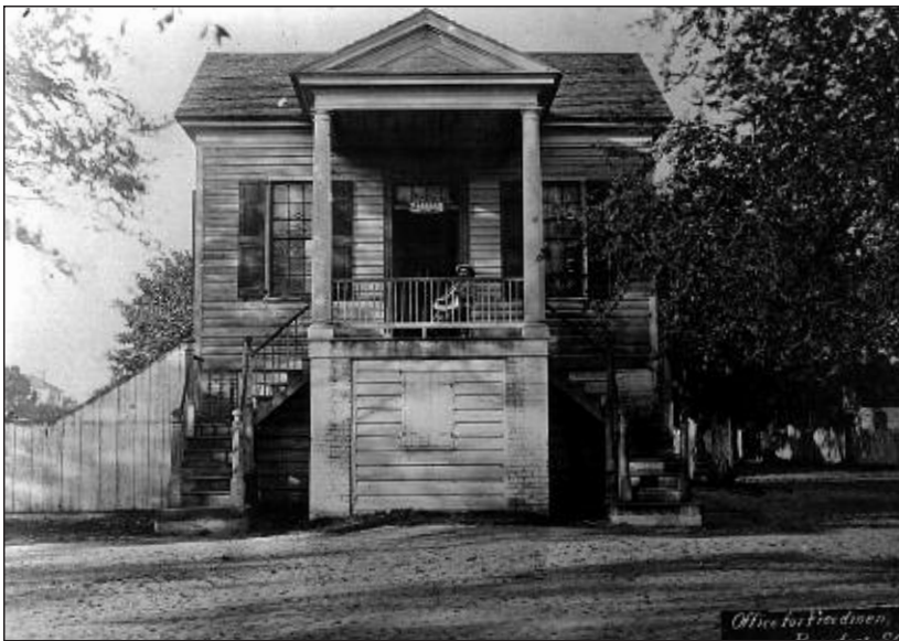
Most Freedmen came in contact with the Freedmen's Bureau at the local level such as at this office in Beaufort, South Carolina. (165-C-394)

Although the Bureau was not abolished until 1872, the bulk of its work was conducted from June 1865 to December 1868. While a major part of the Bureau's early activities included the supervision of aban-