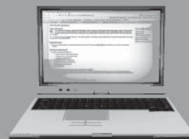
Table of contents Podcasts Ahead of Print Medscape CME Specialized topics