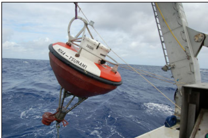
A Dart II buoy being lowered into the Pacific Ocean.

An effective tsunami warning system must include