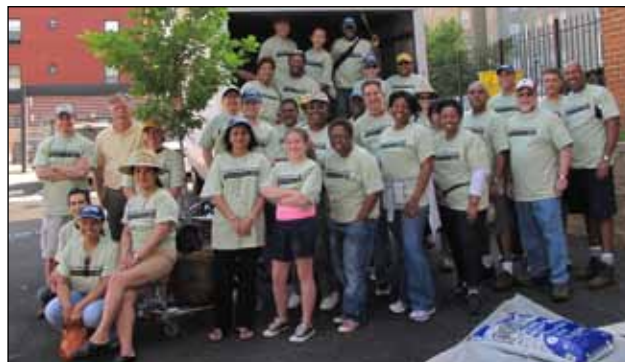
Volunteers from the federal bank regulatory agencies helped landscape an affordable housing development in Washington, D.C., as part of NeighborWorks Week 2011 (see article on page 19).

If the primary purpose of these investments meets the definition of community development, the investments can help meet Community Reinvestment Act (CRA) objectives. Loans and investments used to construct or rehabilitate affordable housing for low- or moderate-income individuals are qualified CRA activities. A construction or rehabilitation project might also include the installation of energy-efficient heating and cooling systems or other “green” components. The inclusion of the