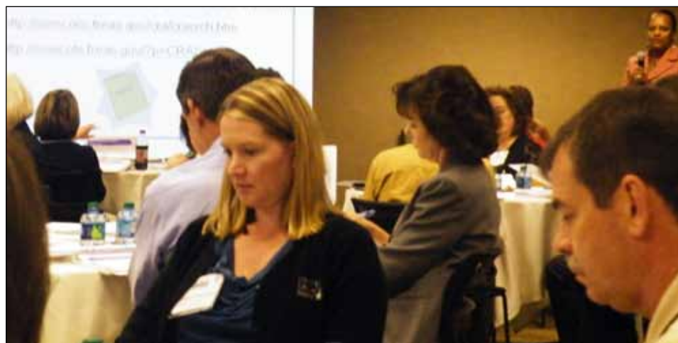
Bankers often participate in CRA roundtables and workshops like this one held in Atlanta, Ga.

opportunities were hard to find due to a lack of nonprofit capacity to manage projects. The bank officer had questions on alternative banking delivery methods. The DCAO provided the bank with the resources needed to answer the questions and help meet CRA objectives.