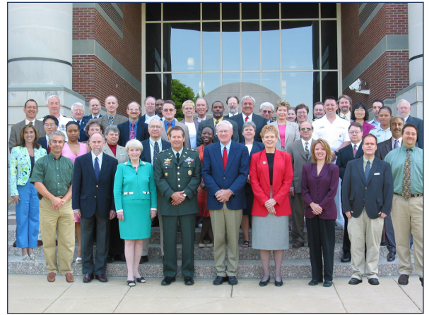
50 full-time faculty contribute a wealth of experience in U.S. and international defense, as well as government, private sector, and academic organizations.