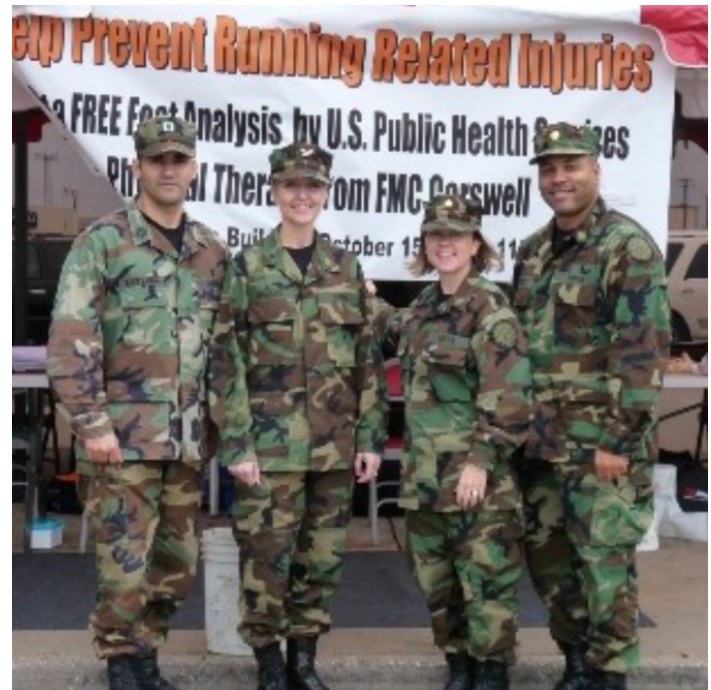
Therapists from the Federal Medical Center in Fort Worth, TX provide community education on running related injuries.

If you are a therapist or therapy student interested in joining the fight for public health, or if you have questions about what we do and how you can make a difference with the Commissioned Corps, we would like to talk to you. For more information, call us at 800-279-1605 or visit our website at www.usphs.gov .