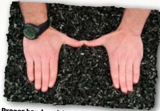
Proper hand position for Close-grip push-ups.

Stretching exercises: 8-10 minutes (cool down)