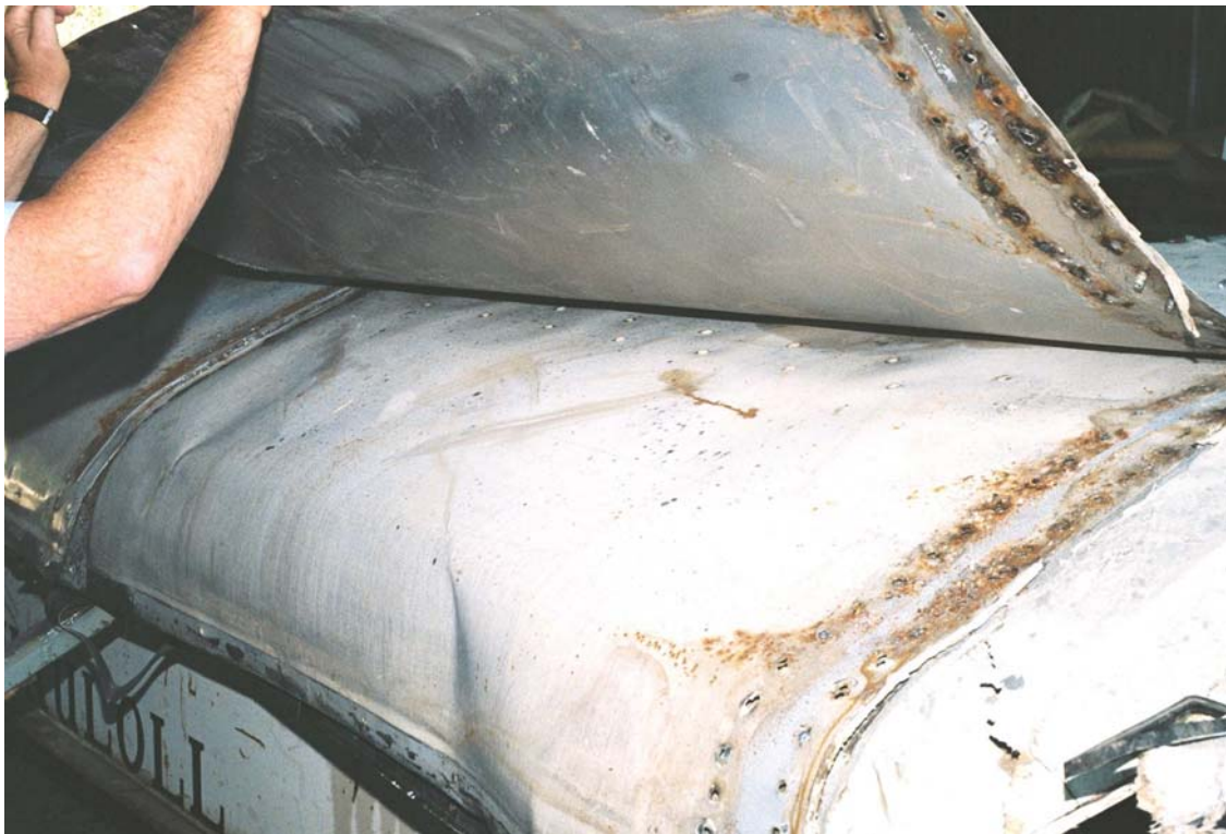
Figure 3. Roof of motorcoach, postaccident.

Although the Inter-Industry Conference on Auto Collision Repair and the National Institute for Automotive Service Excellence have uniform procedures for automobile and light truck roof repair, there are no set standards for buses. Likewise, bus manufacturers and bus repair facilities have no set standards or best practices for repairing motorcoaches. MCI said that this type of repair is not what it would have recommended, though it has no written repair procedures.