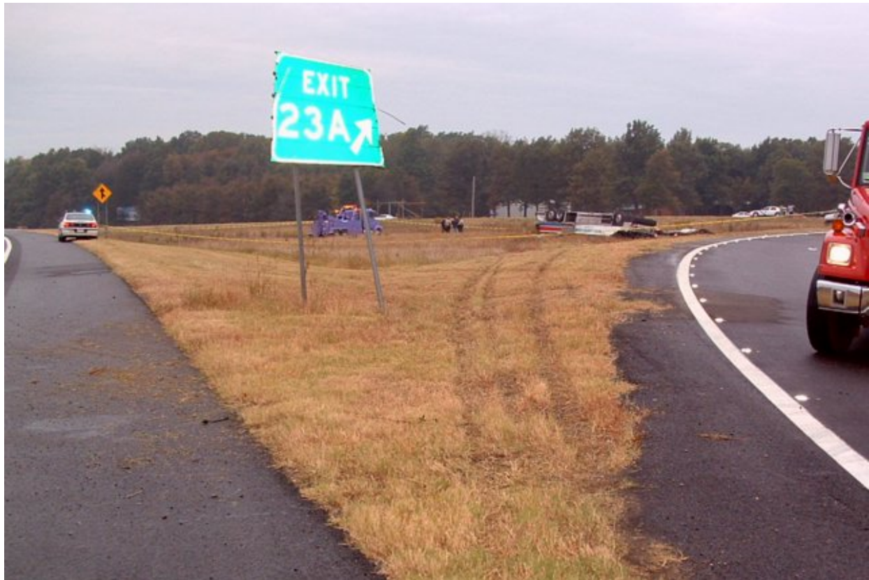
Figure 5. Gore area with furrow marks.

Four tire marks about 71 feet long were located along the southbound shoulder adjacent to the right traffic lane. These marks ended at the edge of the pavement, where furrow marks continued for a distance of 55 feet to the exit 23A sign. Contact damage was observed along the right edge of the exit sign panel, 9 feet above the ground. (See figure 5.) Another tire mark—beginning about 41 feet south of the origin of the four tire marks—was observed along the left side of the exit ramp.