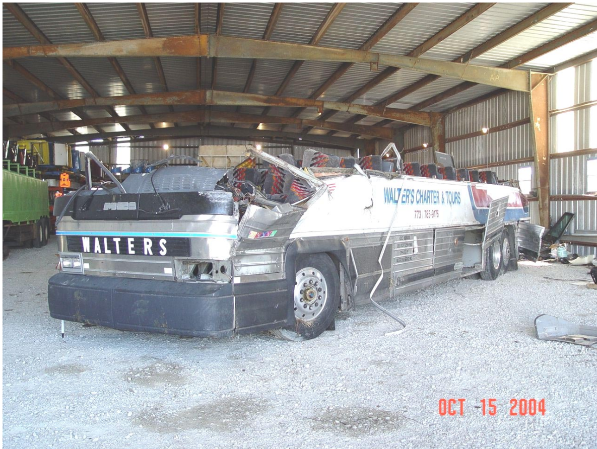
Figure 2. Motorcoach postaccident, with roof detached.

along the right side by several vertical posts. 3 The motorcoach sustained significant interior damage as a result of the rollover.