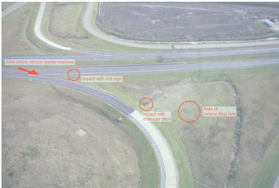
Figure 1. Path of motorcoach from I-55.