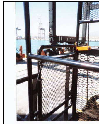
Personnel platform with locking gate

OSHA standards require that personnel platforms be equipped with an access opening fitted with a means of closure (see 29 CFR 1917.45(j)(8)). OSHA recommends that employers use personnel platforms equipped with a full gate system meeting the requirements of 29 CFR 1917.45(j)(1)(iii)(A). The gate should swing inward, be self-closing, and use a positive locking mechanism. If a chain closure is used, OSHA recommends that employers instruct their employees to stand away from the opening while being hoisted.