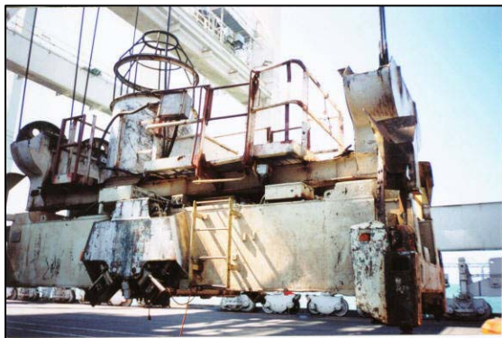
Personnel platform with half gate

Lifts should be coordinated with pre-lift meetings or pre-shift gang meetings. Crane operators should be included in the meeting by radio if they are already in the crane.