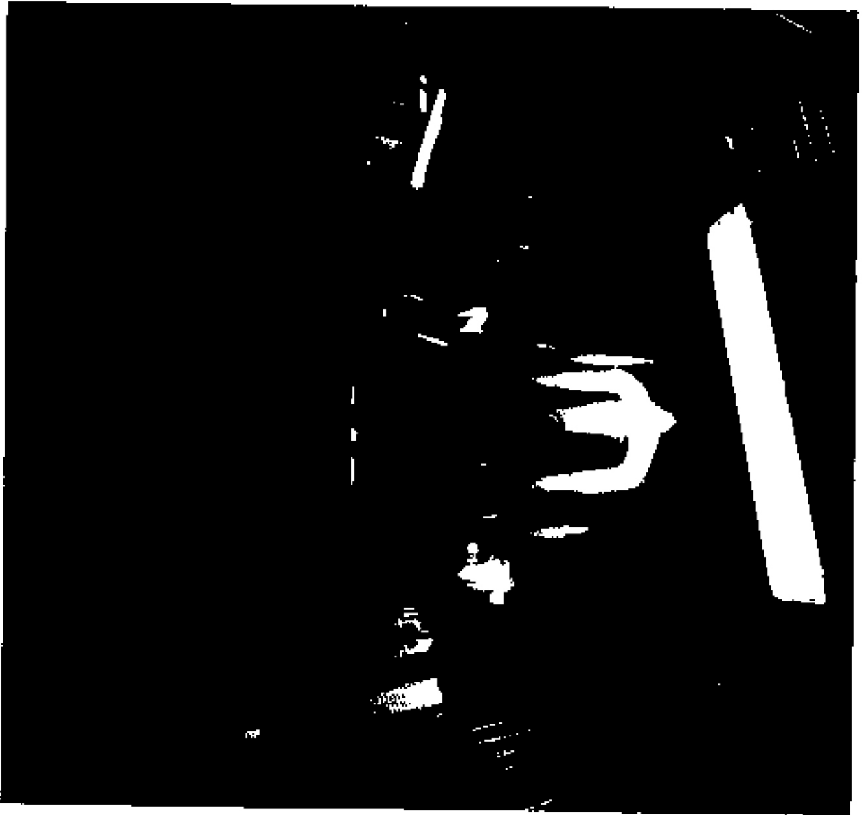
Pulse Jet Mixer