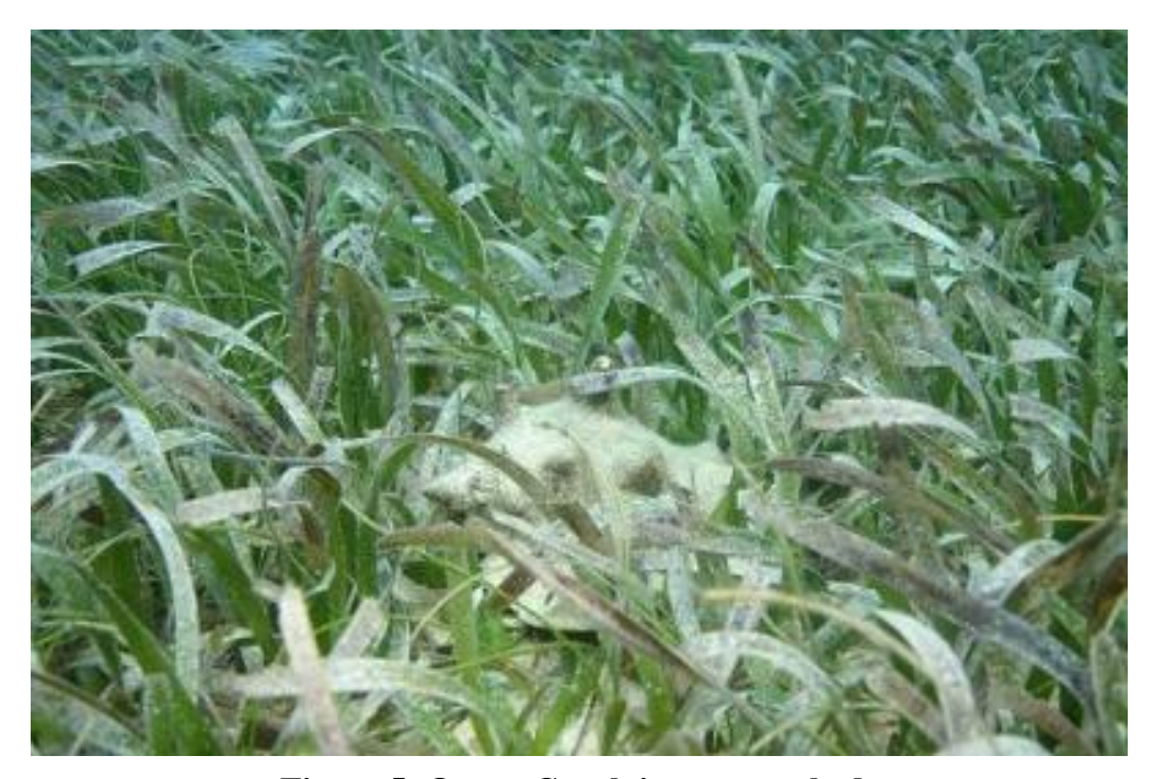
Figure 5: Queen Conch in seagrass bed. Hol Chan Marine Reserve, Ambergis Caye, Belize

structural complexity, and biodiversity in seagrass beds "make them the "marine equivalent of tropical rainforests" (Hill 2002 at 2).