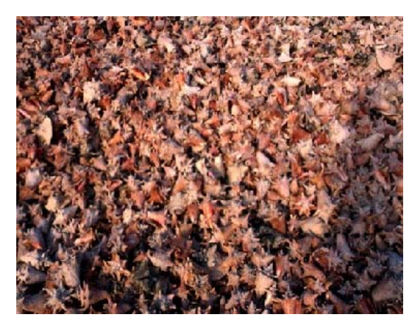
Figure 6: Empty conch shells from intensive harvest.