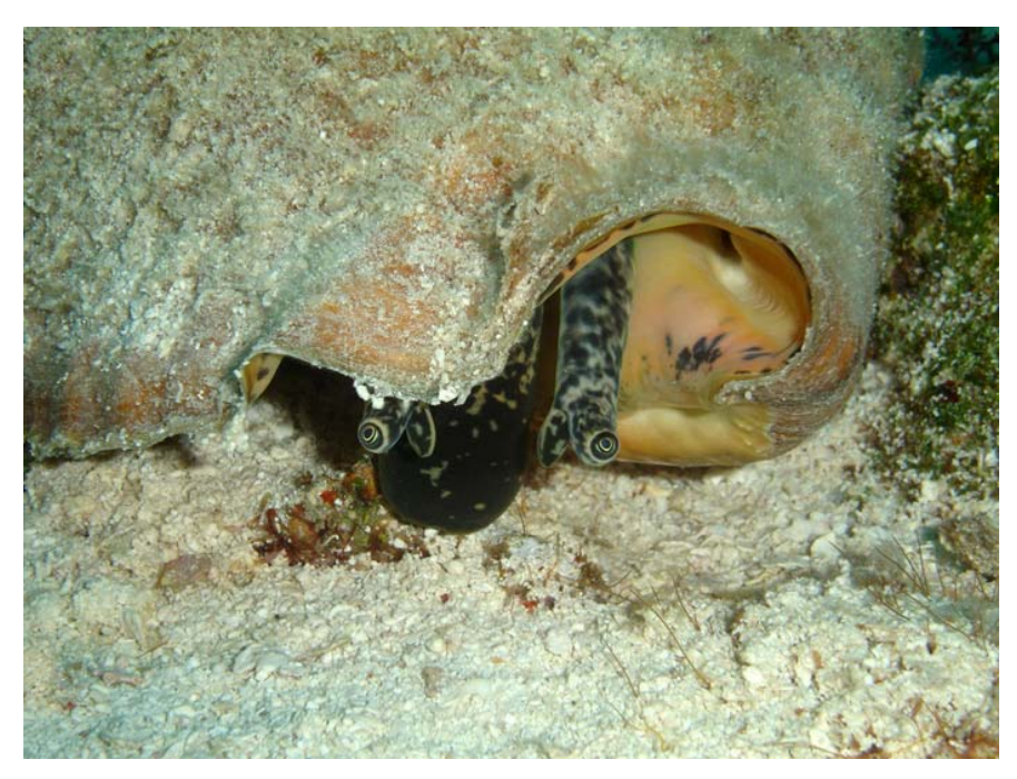
Figure 2: Queen conch (Strombus gigas) eyes and proboscis. Lorenzo\ Alvarez\text{-}Filip\ (2008)