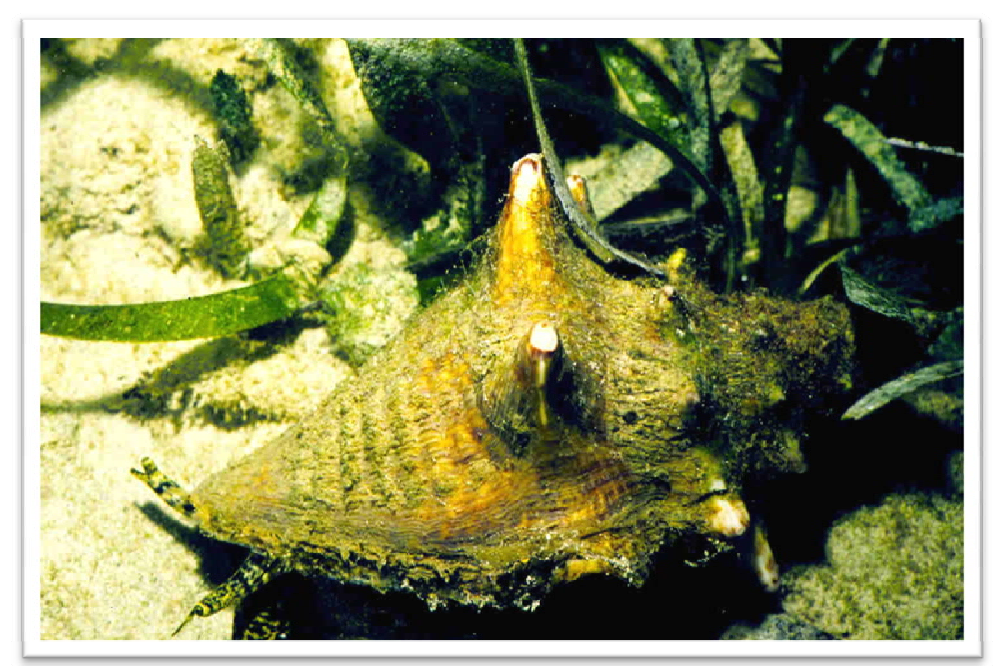
Queen conch (Strombus gigas).

Petition Submitted to the U.S. Secretary of Commerce, Acting through the and the National Marine Fisheries Service