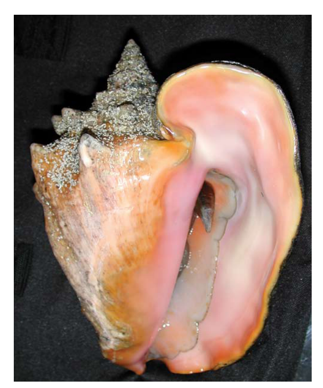
Figure 3: Queen conch shell. Bob Glazer, Florida Fish and Wildlife Conservation Commission