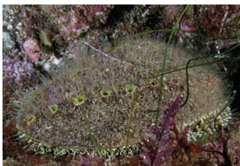
Green abalone, Haliotis fulgens.

Partners have been essential to the accomplishments of the SOC program!