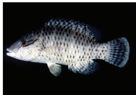
Humphead wrasse, Cheilinus undulatus .

All fact sheets are available for download on the program's website (see pg. 4).