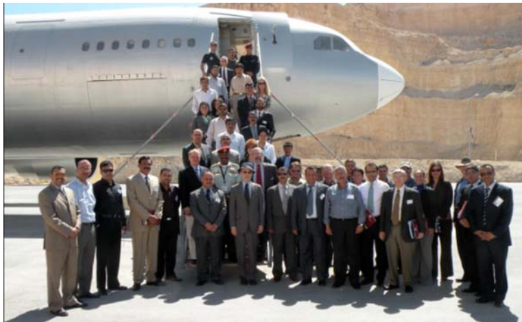
USCENTCOM Continuing Engagement Symposium Participants at the King Abdullah II Special Operations Training Center (KASOTC)

issues relevant to the USCENTCOM region. Three days of presentations by students and SMEs provided a rich framework for discussion. Thirty-five past participants attended, representing Afghanistan, Iraq, Jordan, Kazakhstan, Pakistan and Yemen.