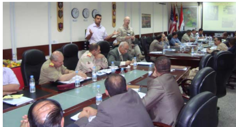
DIILS Iraq MET