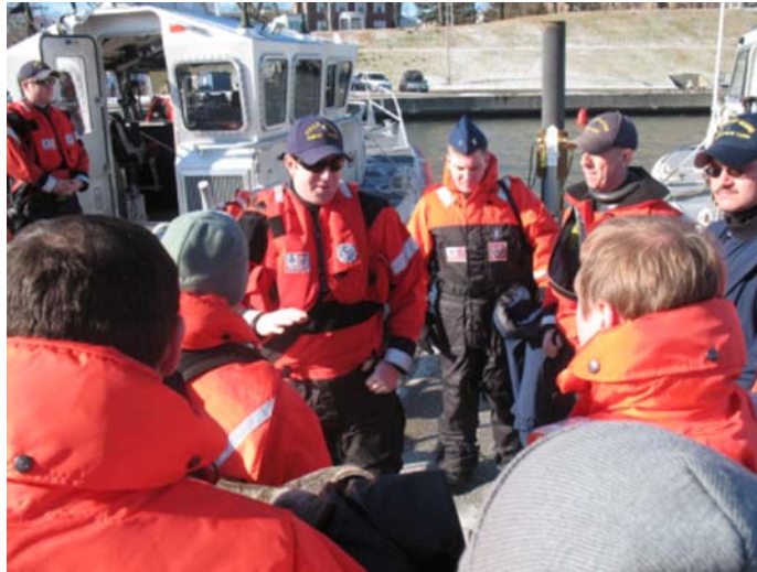
DIILS Moldavian CbT students on a U.S. visit

held annually and provides the U.S. with a forum to guide terrorism policy in the region. Other notable activities in USEUCOM included a JSOU mobile education team (MET) in Croatia that helped to bridge cultural differences that have fueled conflict there for centuries. This particular event brought officers together from seven Balkan countries, most of which had been locked in bitter warfare for the past two decades.