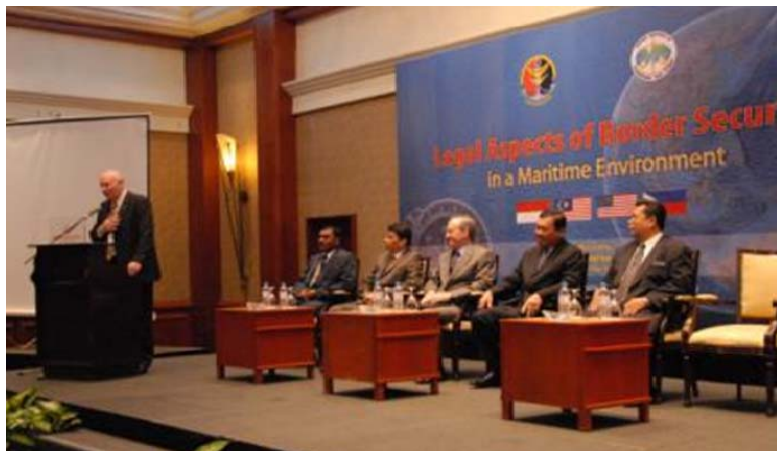
DIILS Malaysia Regional CbT MET

In the U.S. Pacific Command (USPACOM) AOR, graduates from CTFP courses are serving as Deputy Ministers of Defense in two countries. They remain in contact with their CTFP schools and often cite their CTFP education as being the foundation for their decision making. In Thailand, CTFP’s programs on irregular warfare have helped to shape national security policy. Additionally, a civilian graduate of CISA has become an important link between the military and civilian branches of the Thai government, establishing conflict resolution mechanisms and ensuring civilian control of the Thai military. CTFP also provided the forum for a number of key Pacific Rim nations to meet and develop bilateral counterterrorism (CT) agreements, directly improving maritime security in the Sulawesi Sea Lanes.