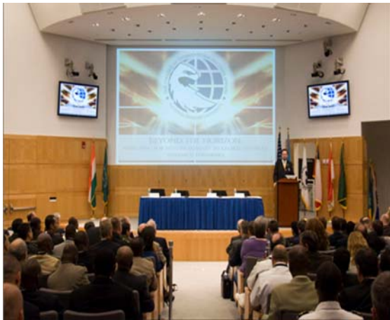
CISA Beyond the Horizon Conference at Lincoln Hall

foreign military officers (O-5 to O-8) and civilian government equivalents from partner nations. The Philippine Secretary of National Defense spoke (at his request) and brought 30 additional senior Filipino officials to the conference. Many of the working group sessions were led by CISA graduates (CT Fellows), who demonstrated substantial expertise and application of principles learned while attending CISA. In addition to building relations among the CT Fellows, representatives from various U.S. Government agencies and departments (Joint Professional Military Education (JPME) institutions, SOLIC&IC, USSOUTHCOM, the Joint Improvised Explosive Device Defeat Organization (JIEDDO), the Defense Advanced Research Projects Agency (DARPA) and the U.S. Department of State (DOS)) were able to engage with the international alumni.