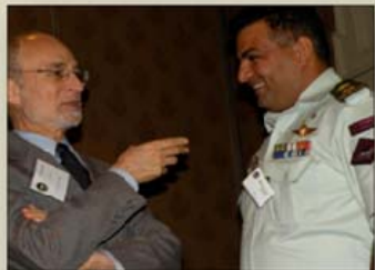
NDU Professor and Alumni at the CENTCOM Symposium

The Assistant Secretary of Defense for Special Operations/Low Intensity Conflict and Interdependent Capabilities (SO/LIC&IC) provides policy oversight. The Defense Security Cooperation Agency (DSCA) provides program and financial management. CTFP requires approval from the Chiefs of Missions and Leahy Vetting prior to any event or engagement.