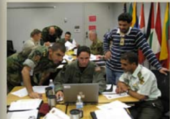
JSOU SOCbT students working on their team project