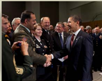
CISA FY09 Graduate speaking to President Obama at the opening of Lincoln Hall