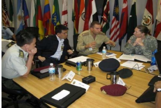
JSOU SOCbT students discussing CbT issues