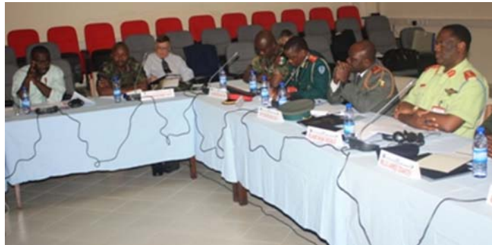
JSOU Ghana Continuing Engagement MET