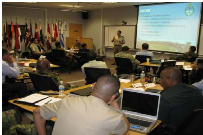
A JSOU SOCbT student presenting his team's final project