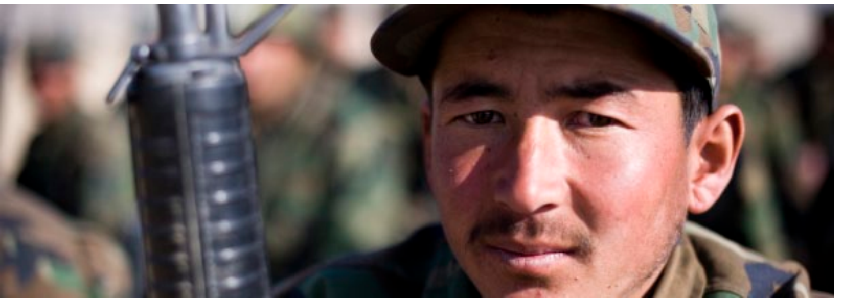
An Afghan National Army recruit waits to conduct squad drills during Basic Warrior Training in Kabul Military Training Center.