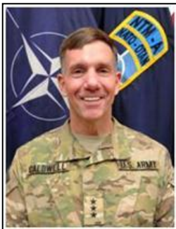
WILLIAM B. CALDWELL, IV Lieutenant General Commander

NATO Training Mission-Afghanistan / Combined Security Transition Command-Afghanistan (NTM-A / CSTC-A) in coordination with NATO nations and partners, international organizations, donors and non-governmental organizations; supports the Government of the Islamic Republic of Afghanistan (GIROA) as it generates and sustains the Afghan National Security Force (ANSF), develops leaders, and establishes enduring institutional capacity to enable accountable Afghan-led security.