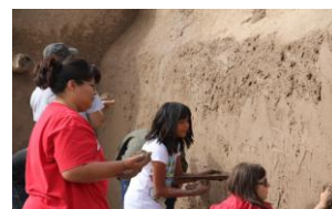
(Sept. 8-12) Ohkay Owingeh Housing Authority hosts mud plaster maintenance workshop for Owe'neh Bupinegh homeowners and Tribal members.