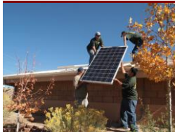
Santa Clara Pueblo Solar Array (Summer 2012)