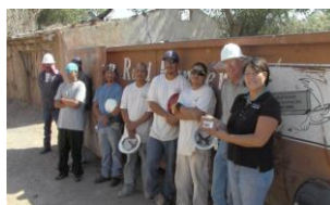
Santo Domingo Trading Post Ground Breaking Ceremony (Aug. 21)