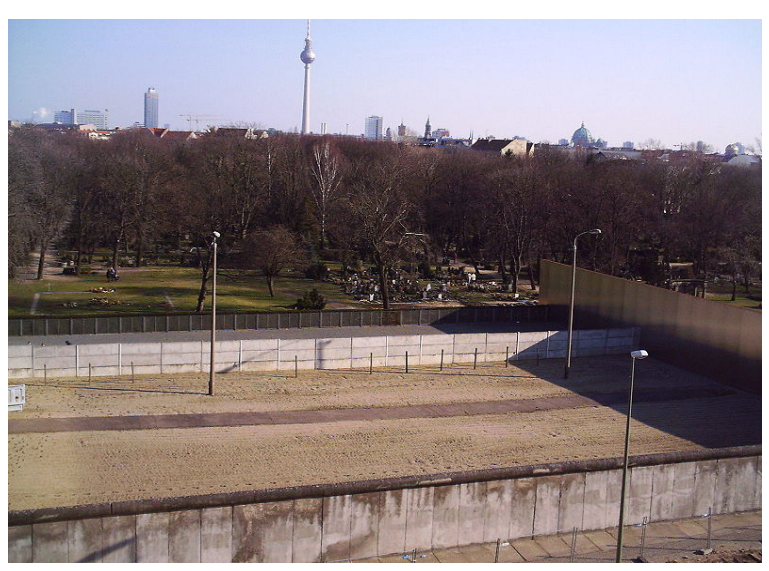
The Berlin Wall Memorial allows visitors to look down on a stretch of the wall from a watchtower.

Over time. number new commemorative sites related to the Berlin Wall began to appear. In 1994-1995, the federal government held a competition to design a memorial for the victims of the Berlin Wall. With ongoing controversy about whether and how to commemorate the Berlin Wall, the federal government eventually approved three projects along Bernauerstrasse, the main street where the Wall divided the city: a memorial, a documentation center, and the Chapel of Reconciliation which was demolished