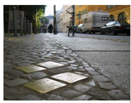
Stumble stones in Berlin

Rainer Klemke, the key official interviewed for the case study, explains that "our experience is such that with a narrower focus, the acceptance of a memorial increases," so a dedicated to all victims or all wars would probably be too general because people are drawn to