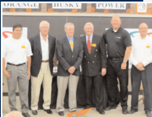
Congressman Dan Burton at Hamilton Heights Elementary School with Verdetherm's Sales and Tech Team discussing green energy policies and technology.

In August, I held a series of Town Halls for the residents of the 5th Congressional District and heard from hundreds of Hoosiers about what's important to them and what they want their elected officials in Washington to do. It truly had been a summer of discontent in Washington and all across this great Nation. Washington's excessive spending and debt has taken center stage in the minds of Americans. With Indiana's unemployment hovering around nine percent and seniors fearful that the benefits they rely on could be cut, it's extremely important I meet with my constituents and have a frank conversation about the issues that matter most to them.