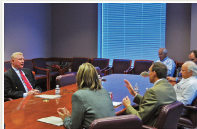
Congressman Burton and local health care providers discuss the implications of the new health care law.