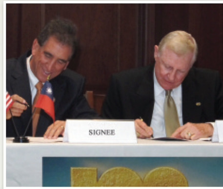
Congressman Burton attends a signing ceremony to strengthen our agricultural community in Indiana by supporting trade agreements with Taiwan.