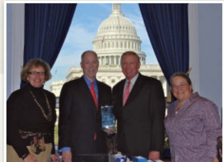
Congressman Burton receives the 2011 National Public Policy Award from representatives of the Society of Gynecologic Oncology for his long-standing support of the Ovarian Cancer Research Program at the Department of Defense.