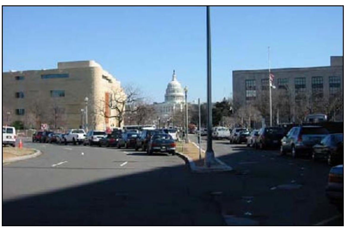
View along Maryland Avenue Bisecting Site Looking Towards the Capitol