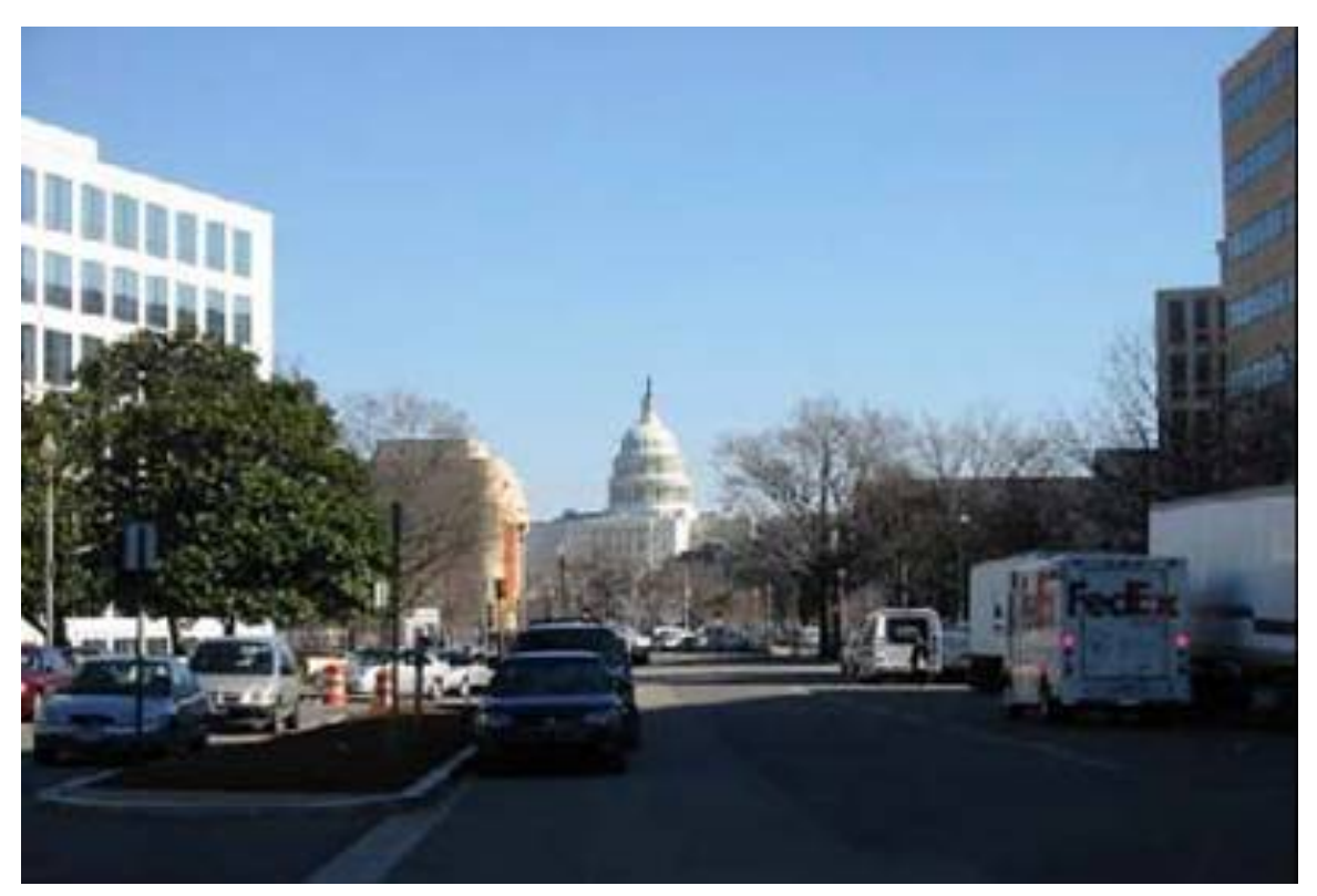
View along Maryland Avenue Looking Towards the Capitol