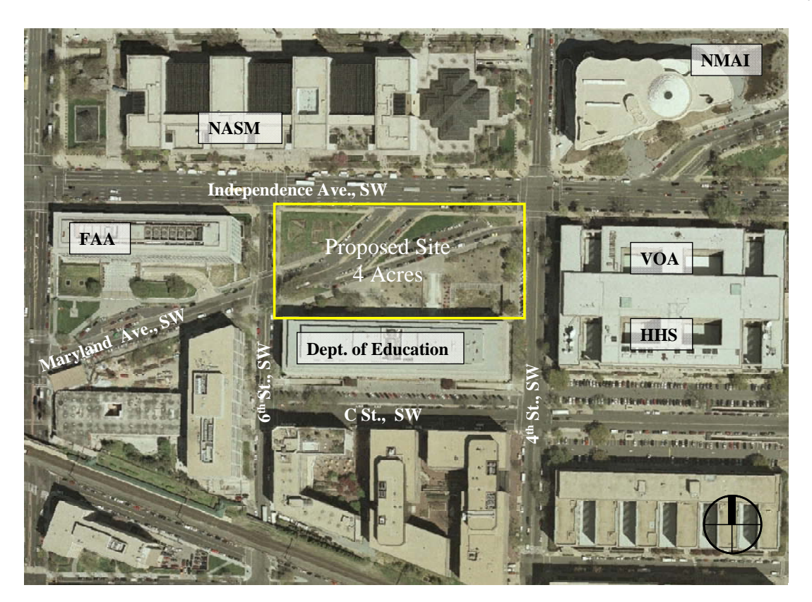
Proposed Site at Maryland and Independence Avenues, SW