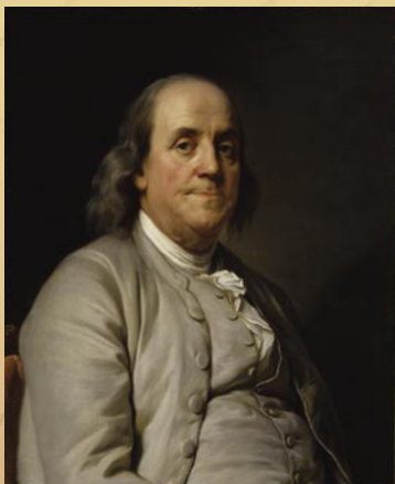
Benjamin Franklin, by Joseph Siffred Duplessis; National Portrait Gallery, Smithsonian Institution; gift of the Morris and Gwendolyn Cafritz Foundation

At the conclusion of the Constitutional Convention, Benjamin Franklin was asked, “ What have you wrought? ” He answered, “ a Republic, if you can keep it. ”