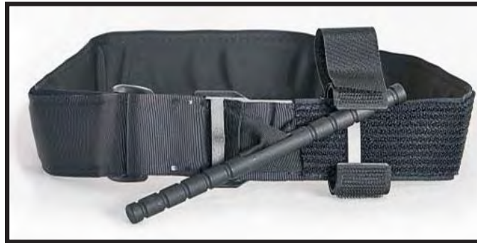
Fig 3-2-1: C-A-T tourniquet