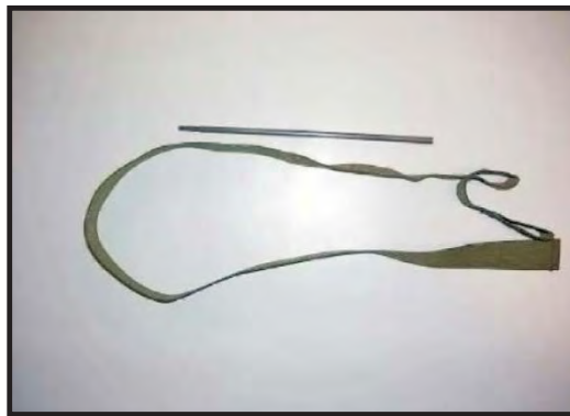
Fig 3-2-2: “Kandahar Tourniquet”

The Canadian OMLTs sprang into action, developed, and tested their own simple and effective “Kandahar Tourniquet.” The “Kandahar Tourniquet” is easy for the Afghan soldiers to use and very cost effective. The estimated unit cost is $3, including the instruction sheet and packaging. The Canadians have placed an order for 4,000 units and plan to purchase enough “Kandahar Tourniquets” for all the Afghan soldiers in their area of operation.