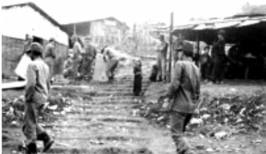
Pathway up to LS36's CP. The ascending trail, in this case, had dried enough to be quite navigable. Personnel in uniform are RLA soldiers: Those in black "pajamas" (top right) are Hmong.

The short walk up the dirt airstrip to the CP was exactly that: uphill. Just like in the movie Air America , this strip, too, was planted on the side of a small rise of ground; landings were conducted up the hill, while take-offs ran down the hill. The results of not making a good take-off were lasting.