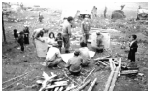
Being so remote and surrounded by communist forces, life at sites such LS36 was a constant struggle. Complete families, forced to flee the ever-advancing NVA and PL onslaughts, lived in utter poverty and depravation, supported only by CIA and Air America operations.

In the small room illuminated only by the doorway and narrow observation/gun port apertures, I found the resident CIA agent (technically referred to as a CAS—Controlled American Source—officer) hunched over a set of tactical radios, straining to make sense of frantic Laotian conversations streaming out of the small speaker. He irritably waved me into silence as I greeted him and quickly returned his concentration to listening while frequently jotting down particular bits of information. After two or three minutes he turned to me with a worried and vengeance-set face.