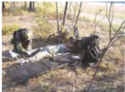
PJs train for rapid assessment and initial care in a rescue of a downed crew member.