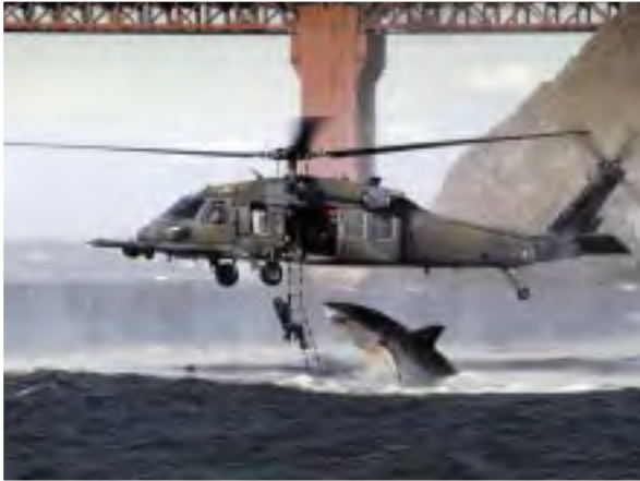
A different version of Lake Placid