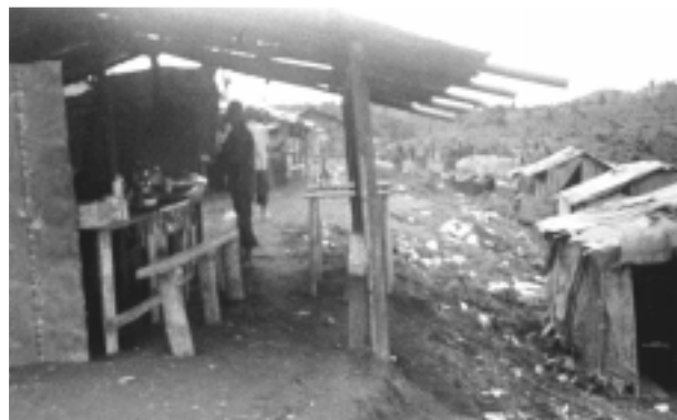
Cooking shed and "living quarters". Note squalid, siege-like appearance of site and reutilization of virtually ever scrap of building material.

I entered the base of the fortress through a gap in the wire, a crude swinging gate of logs, barbed and concertina wire. This was manned by incredibly young Hmong boy-warriors who were hardly taller than the M-1 Garand rifles they were struggling to hold upright. Their average age was somewhere around fourteen years old. These boys' leadership were men hardly in their twenties, the result of persistent years of North