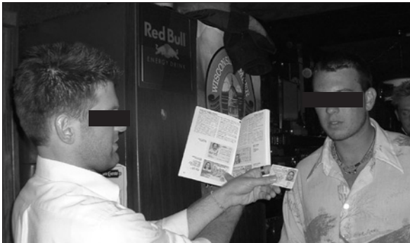
ID guides can help doormen to identify documents that have been falsified.