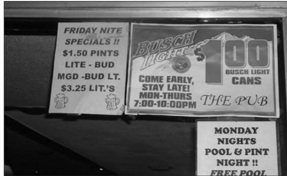
Drink specials encourage heavy drinking among all customers, some of whom may be underage.

Many high school and college students say that they attend parties or go out drinking because “there is nothing else to do.” Like older adults, adolescents and young adults enjoy socializing and need a variety of avenues to interact with peers, make new friends, and pursue romantic relationships. In the absence of alcohol-free places to socialize, young people go to parties where alcohol is present, and may succumb to peer pressure to drink.