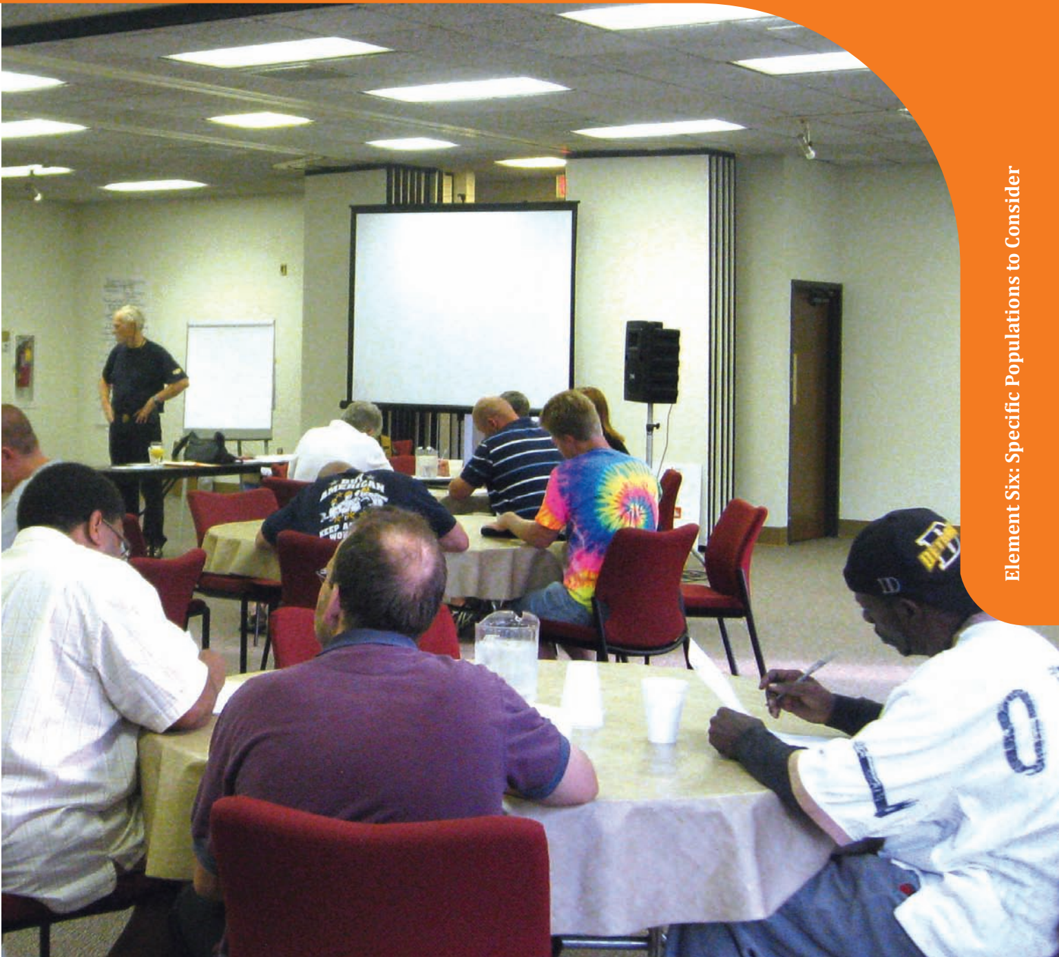
Element Six: Specific Populations to Consider