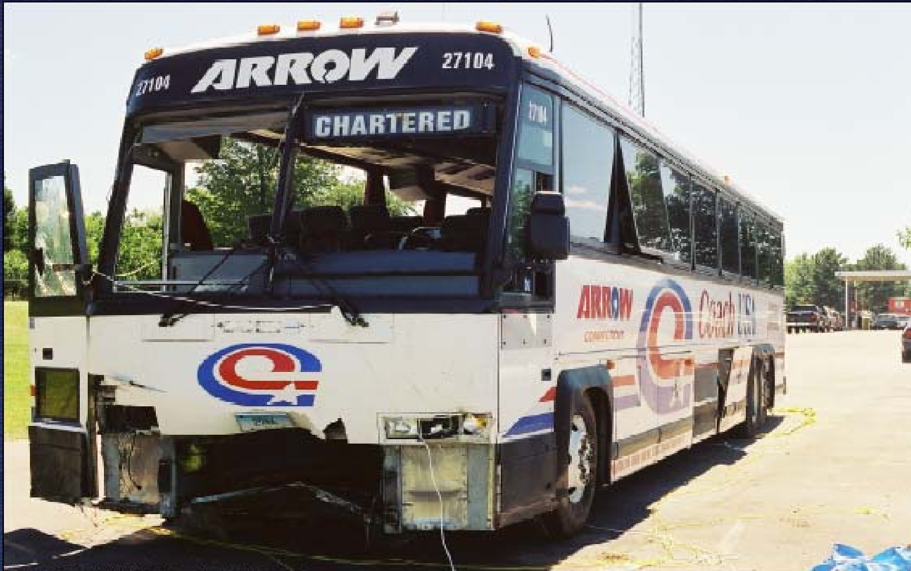
VEH Photo #3 - Front and Left Side Collage View, as Taken From the Front to the Rear