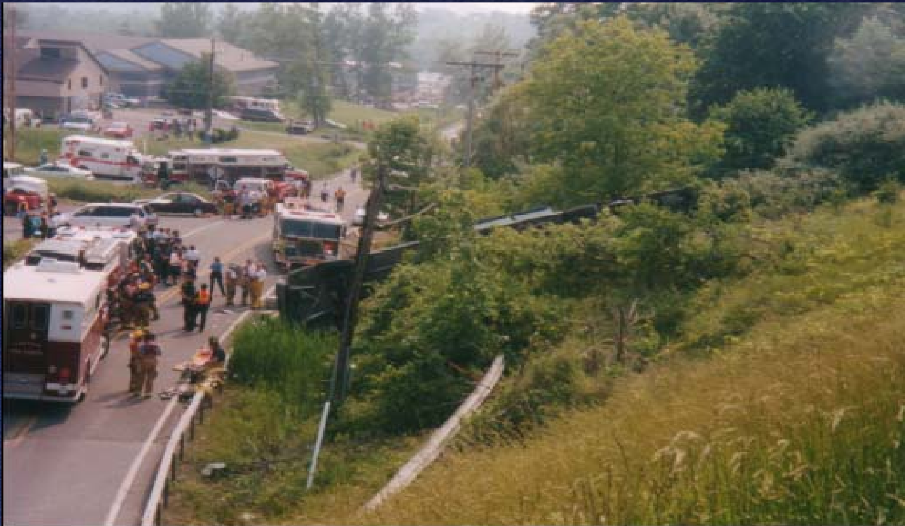
HWY Photo #16 - Final Rest Position of Motorcoach on Embankment of Acceleration Ramp