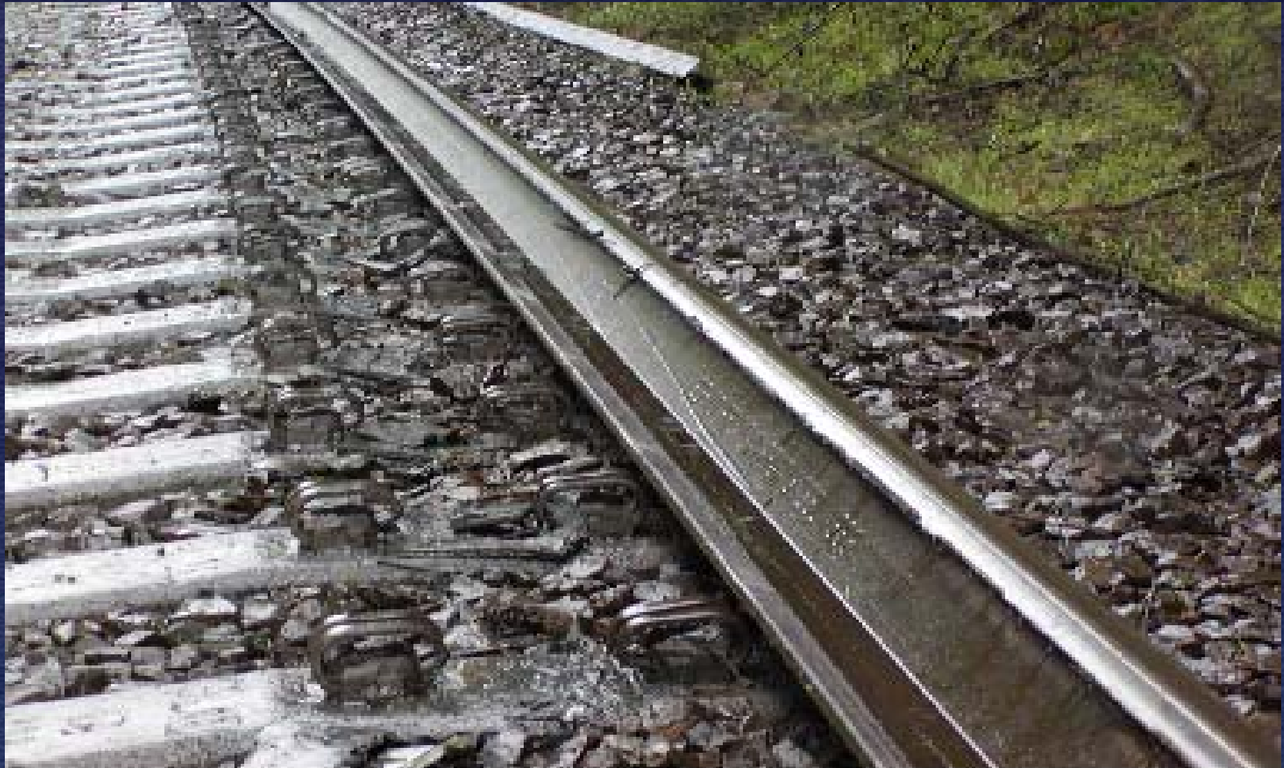
Appendix C - Photo of area with concrete tie abrasion