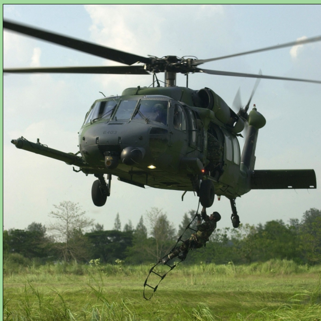
Service members train for a recovery mission.

Conferees represented subject matter experts spanning the entire spectrum of the personnel recovery mission area. This year saw significant interagency participation from ten different organizations, as well as international representatives from Australia, Canada and New Zealand.