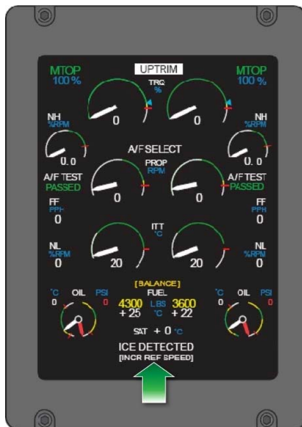
Figure 3. Q400 Engine Display Showing Ice Detected and Increased Reference Speeds Message

The Q400 engine display shows an “ICE DETECTED” message, as shown in figure 3, when one or both ice detector probes detect more than 0.5 millimeter (0.02 inch) of ice. The message appears in reverse video (black letters on a white background) for 5 seconds if the ref speeds switch has already been set to the increase position. After the 5-second period, the message appears in normal video (white letters on a black background, as shown in figure 3) when ice is detected and the ref speeds switch remains set to the increase position. If the ref speeds switch is set to the off position when ice is detected, the message flashes with yellow letters on a black background until the switch is turned to the increase position. In addition, when the switch has been selected to the increase position, an “INCR REF SPEED” message (also shown in figure 3) appears in normal video, regardless of whether ice has been detected.