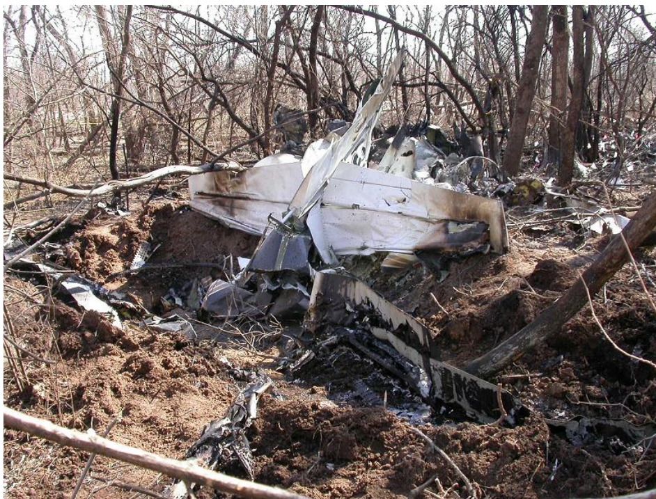
Figure 3. Horizontal stabilizers and elevators with fire-damaged wreckage below.

Examination of the airplane’s horizontal stabilizer at the accident site revealed that it was oriented leading-edge down on top of a ground crater that contained fire-damaged wreckage debris. Dark brown to black soot patterns on the left and right horizontal stabilizers and elevators corresponded to the location of fire-damaged wreckage in the crater below. Soot patterns that extended into crush-damage folds on the trailing edge of the left elevator skin corresponded to an area where a damaged tree or tree limb came to rest on top of the wreckage. (See figure 3.)