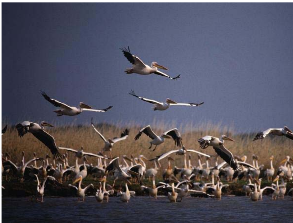
Figure 2. American white pelicans.

114 in. 32 (See figure 2.) The examination of a preserved American white pelican at the Smithsonian Institution's ornithology collection showed that the bird's body could be about 30 in long with a 12- to 15-in diameter.