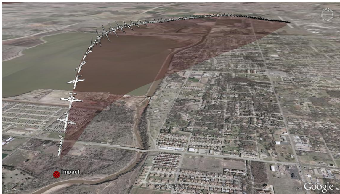
Figure 5. Simulation-based illustration of the airplane's descent and left roll through the inverted position.