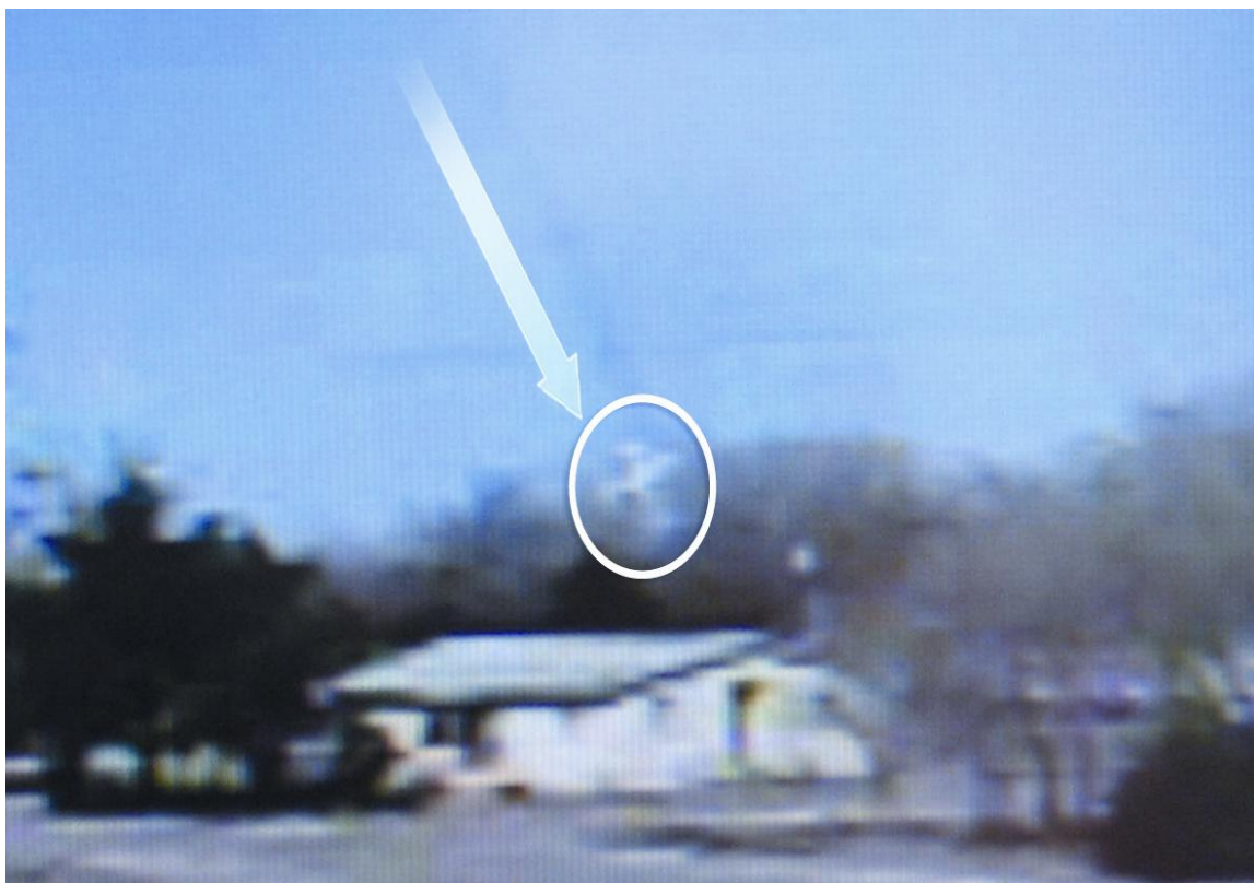
Figure 1. Screen capture of a video image showing the accident airplane (circled) and the visible trail behind it (to the right of and approximately parallel to the arrow) before ground impact.

A security camera located about 1/2 mile southwest of the accident site captured images of the accident airplane descending steeply, nose down to the ground while emitting a visible trail. (See figure 1.) The video also showed that a large fireball followed the airplane’s impact.