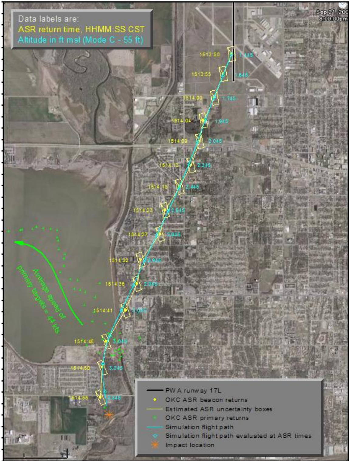
Figure 4. Plot showing primary and secondary radar returns with overlay of the simulation flight path.