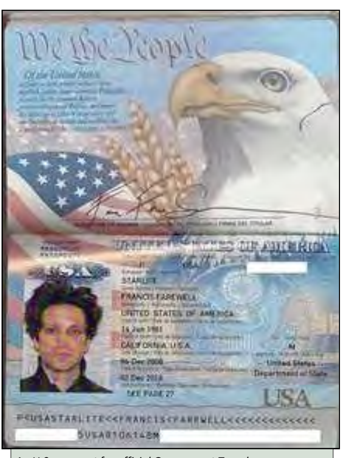
An U.S. passport for official Government Travel.

There is virtually no method to rush the State Department in this process. Civilians may NOT utilize a personal passport for official travel and there are dangers in doing so. If on official orders, an official passport