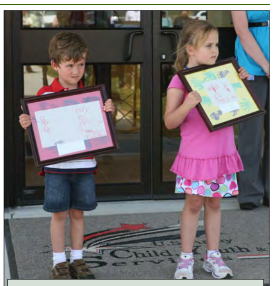
Children from the Tieman CDC wait to present artwork to the Tieman family. The artwork included hand and foot prints of CDC children as well as quotations by children regarding what it means to be a hero.

The onset of summer also brings Summer Camp back to Letterkenny. Summer Camp began on June 13 and will include a variety of activities and field trips. Children enrolled in summer