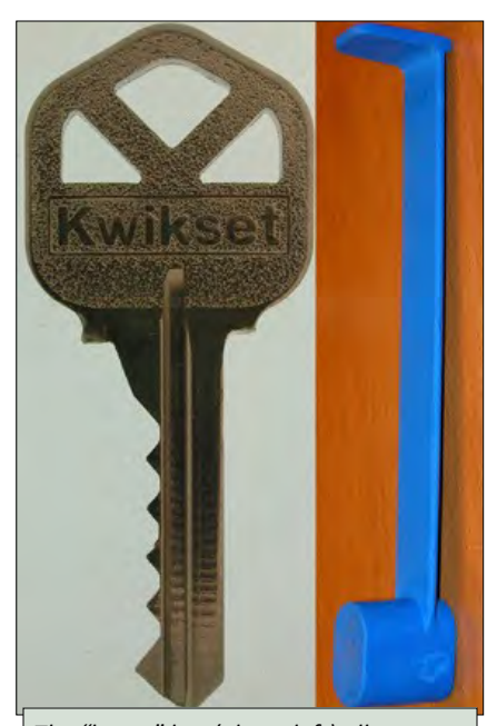
The "bump" key (above left) allows burglars easy access to homes with standard, tumbling locking systems.

Expensive locks may not be the best option. Expensive locks considered to be bump proof in the past have all been defeated by lock picking groups. Most all mechanical locks are susceptible to lock bumping; however, each requires a