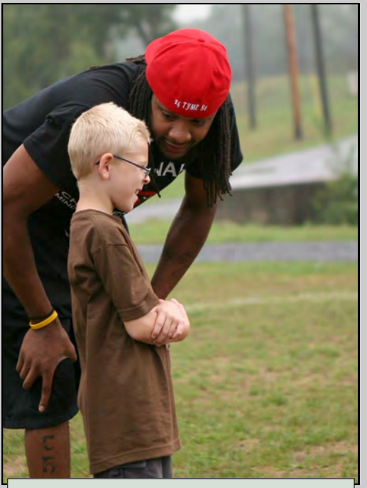
Cardinals wide receiver, Ottis Lewis, talks strategy with a youth camper during youth camp

The Summer Youth Camp is open to youth ages six through twelve. Active Duty military, Active Reserve members, DoD Civilians and Contractors are eligible to utilize the program. The camp ran for eleven weeks, from June 13 to August 26.