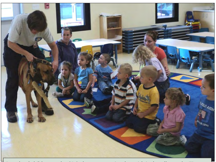
Preschool children at the CDC observe a service dog with its handler at the Tieman Child Development Center the week of October 3rd.

In an effort to promote literacy and language use volunteer readers and the Book Mobile have visited the CDC. Stories are read to the children by LEAD Volunteers