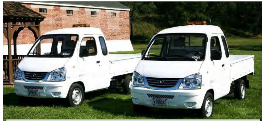
LEAD's commitment to environmental stewardship is demonstrated in the various green vehicles, including the Vantage Vehicle GreenTruck EVX1000, which are used to reduce the carbon footprint and air pollution. This is just one example of the various measures the Depot has taken to actively engage in proactive environmental protection that comply with regulations and guidelines.

Letterkenny has again been recognized for its commitment to environmental responsibility.