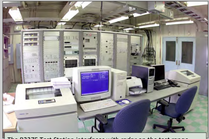
The P2275 Test Station interfaces with radar on the test range

After all local diagnostics tests have been performed and meet the satisfaction of the technicians and the Quality Control Inspector, the radar is put in the environ-